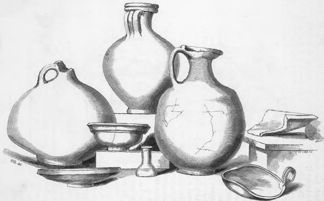
Roman Pottery found at Westergate, Sussex.

Height of Large Vase, 9\frac{1}{2} inches.