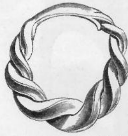
Saxon Gold Ring. Bormer, Sussex.

noticed the gold ring found at Bormer, 2 of which a representation is annexed. Its similarity to the gold ornaments found at Soberton, 3 with coins of William the Conqueror, seems to preclude our attributing this object to an earlier period.