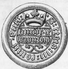
Seal of Wangford Hundred.