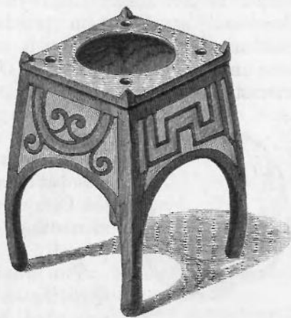
Height 2 inches.