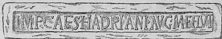
Pig of Lead found on Cromford Moor. British Museum.