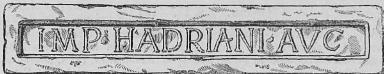
Pig of Lead found at Westbury, Salop. British Museum.