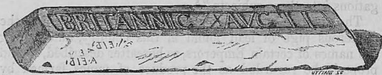
Fig of Lead found near Blagdon, Somerset. British Museum.