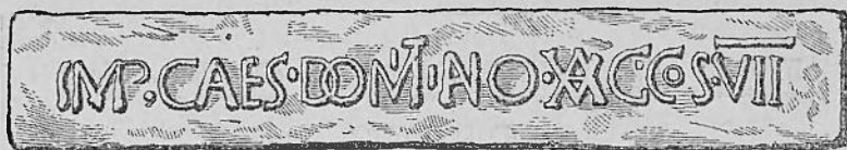
Pig of Lead found at Hayshaw Moor. British Museum.