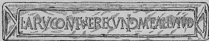
Pig of Lead found on Matlock Moor. British Museum.

Lysons has engraved this pig, and also the inscription on a larger scale, in his History of Derbyshire , p. ccvi., and has pointed out that LVTVD is unquestionably, according to his opinion, a contraction of Lutudarum , supposed to be the Roman station, mentioned in Ravennas , as already stated in the notice of one of the pigs of the time of Hadrian.