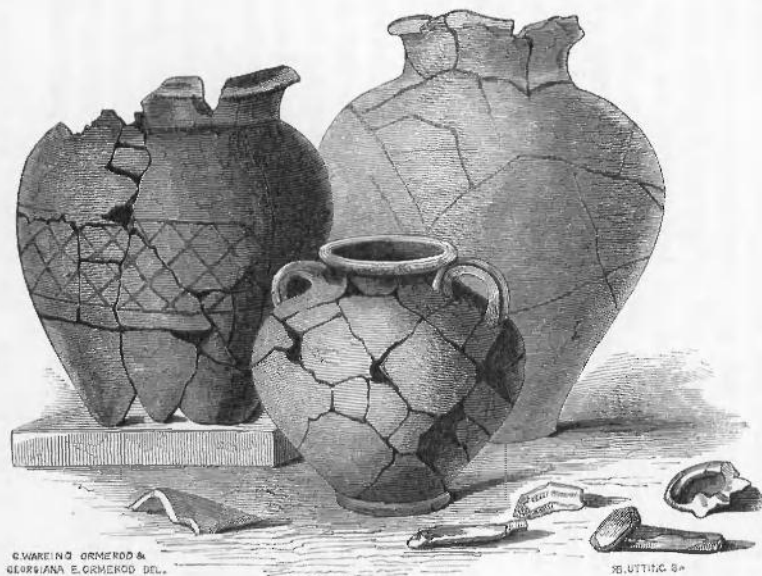
Urns of Red and Grey Roman Ware, found in 1859, on the supposed site of a Military position, near the confluence of the Severn and the Wye.

Height of the largest Urn, about 11\frac{1}{2} inches. Height of the two-handled Urn, 7 inches.