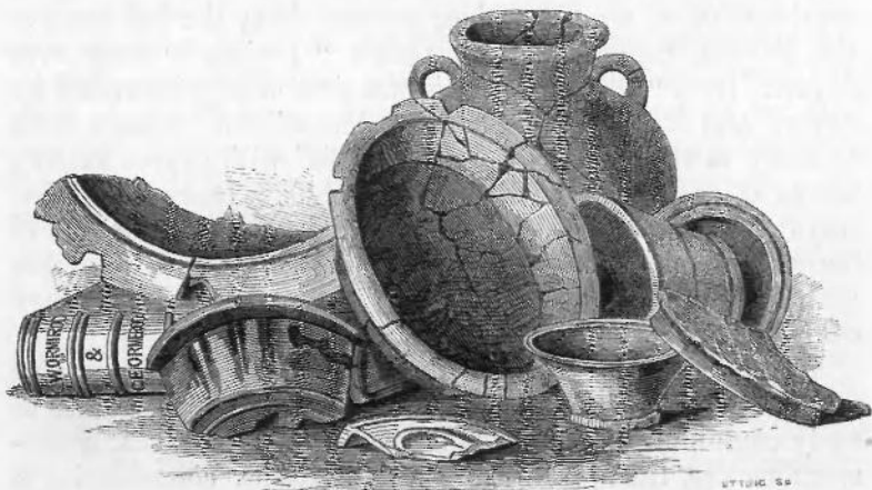
Roman Pottery, discovered at Sedbury. Outside Diameter of central basin 9½ inches.

On opening drains to the depth of four feet, in the grounds near the cliffs, to the south of the tumulus before-mentioned, Roman pottery was discovered in each successive cutting, in the lines marked on the plan, at the points where the draining excavations crossed the deeper ancient lines. The pottery, hitherto found in these later excavations, includes some cinerary urns, one of which resembles a Cirencester vase, which has been published ; but the greater part consists of amphoræ , lagenæ , ollæ , and mortaria , of ordinary