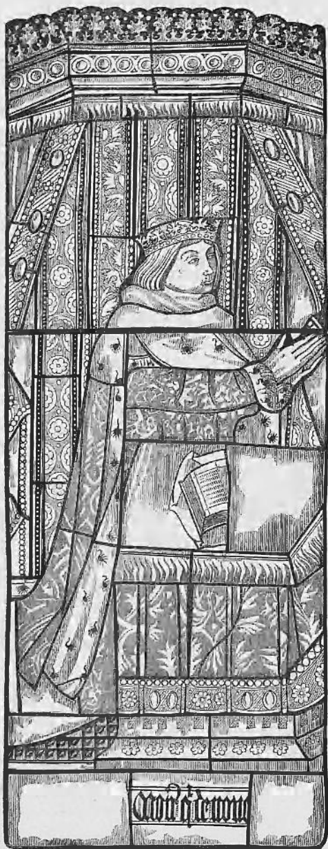
Edward, Prince of Wales. (Afterwards Edward V.) From the East Window of Little Malvern Church.