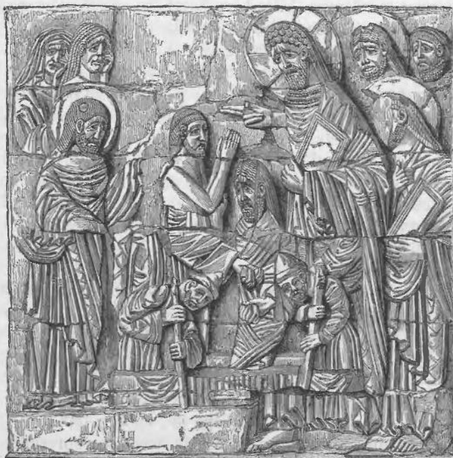
The Raising of Lazarus: Chichester Cathedral. See p. 2, ante.