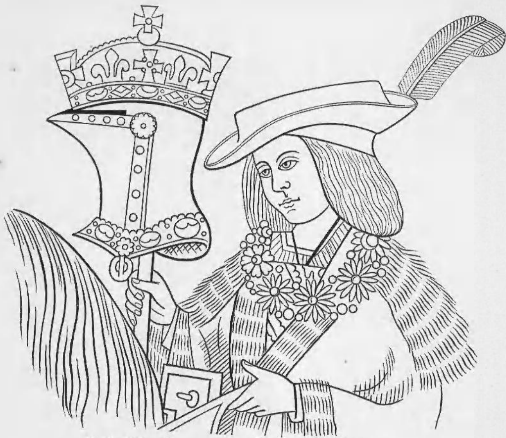
Le Heaulme du Roy. From the Tournament Roll of Henry VIII. in the Heralds' College.