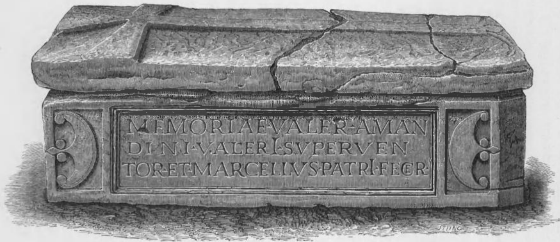
The Roman Sarcophagus, discovered November, 1869, in the North Green, Westminster Abbey.

(Length, 7 ft. ; height of the cist, 18½ in. ; thickness of the cover, 6 in.)