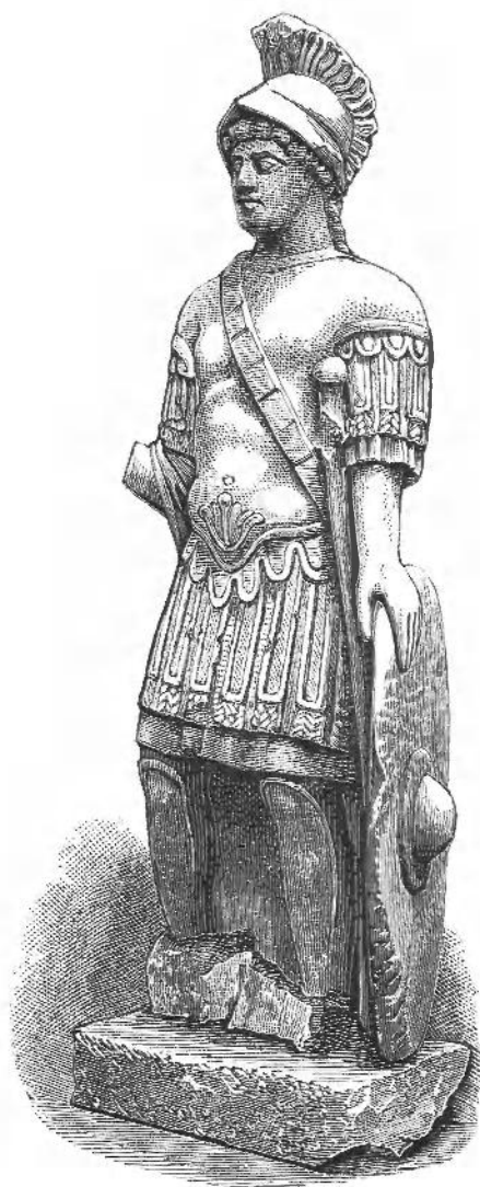
Roman Statue found at York.