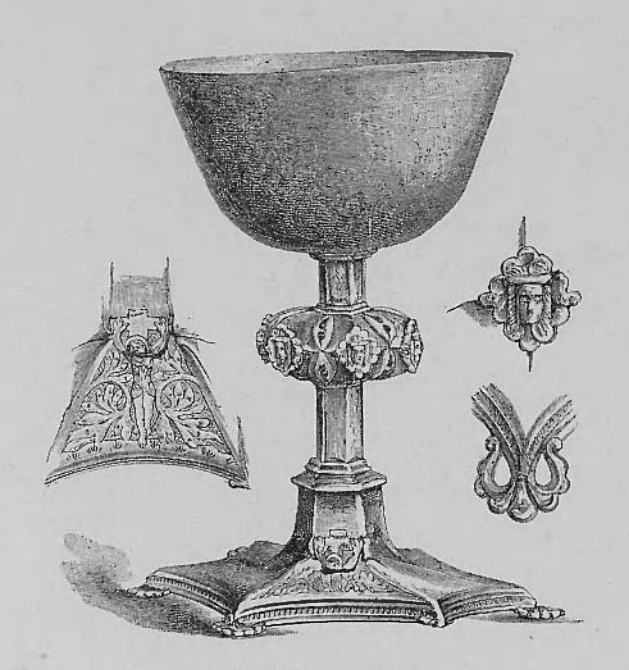
The Old-Hutton Chalice.