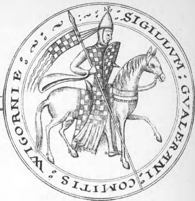
SEAL OF WALERAN, COUNT OF MEULAN.