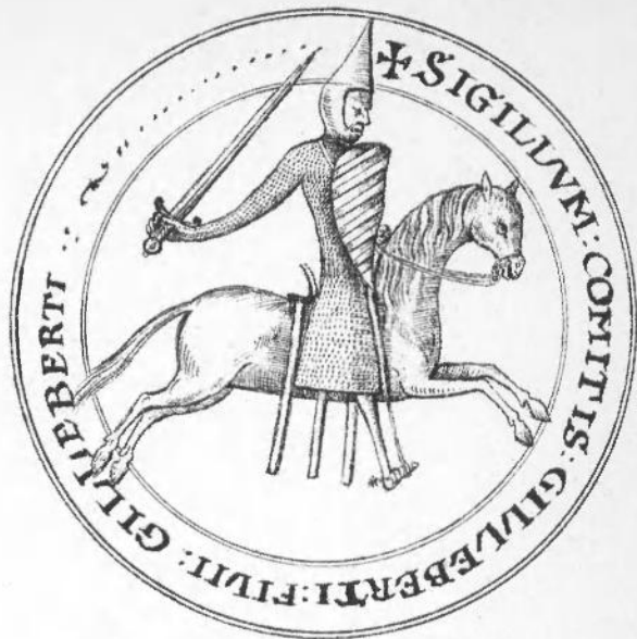
SEAL OF GILBERT DE CLARE, EARL OF PEMBROKE.