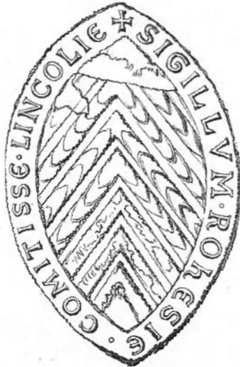
SEAL OF ROHAIS DE CLARE, COUNTESS OF LINCOLN.