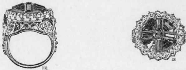
THE QUEEN'S CORONATION RING.

The stone of the ring is a large rounded sapphire ( en cabochon ), set à jour or open at the back, 13 millimeters in diameter and surrounded by brilliants. The sapphire is inlaid with a cross of equal arms, made of rectangular rubies, one small table ruby, foursquare, being in the centre of the cross.