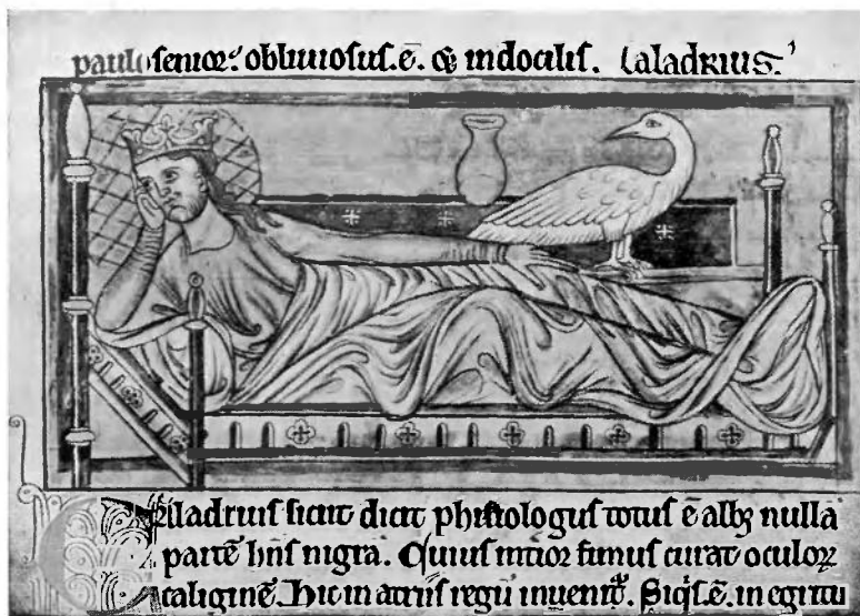
NO. 2. CALADRIUS FORETELLING RECOVERY (MS. Harl. 4751, B.M.).