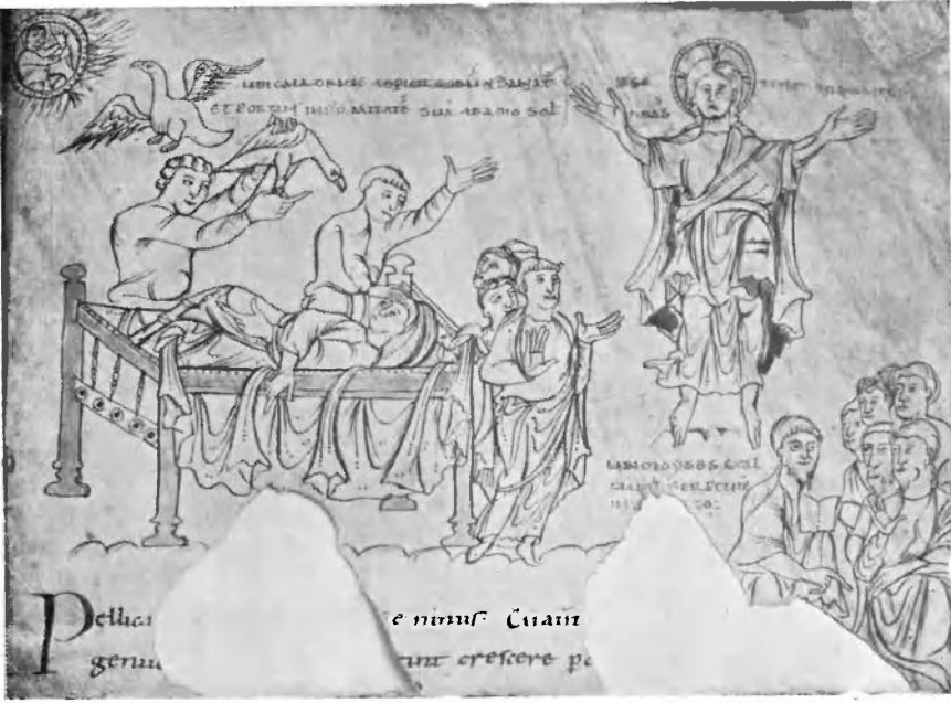
NO. I. CALADRIUS FORETELLING RECOVERY.