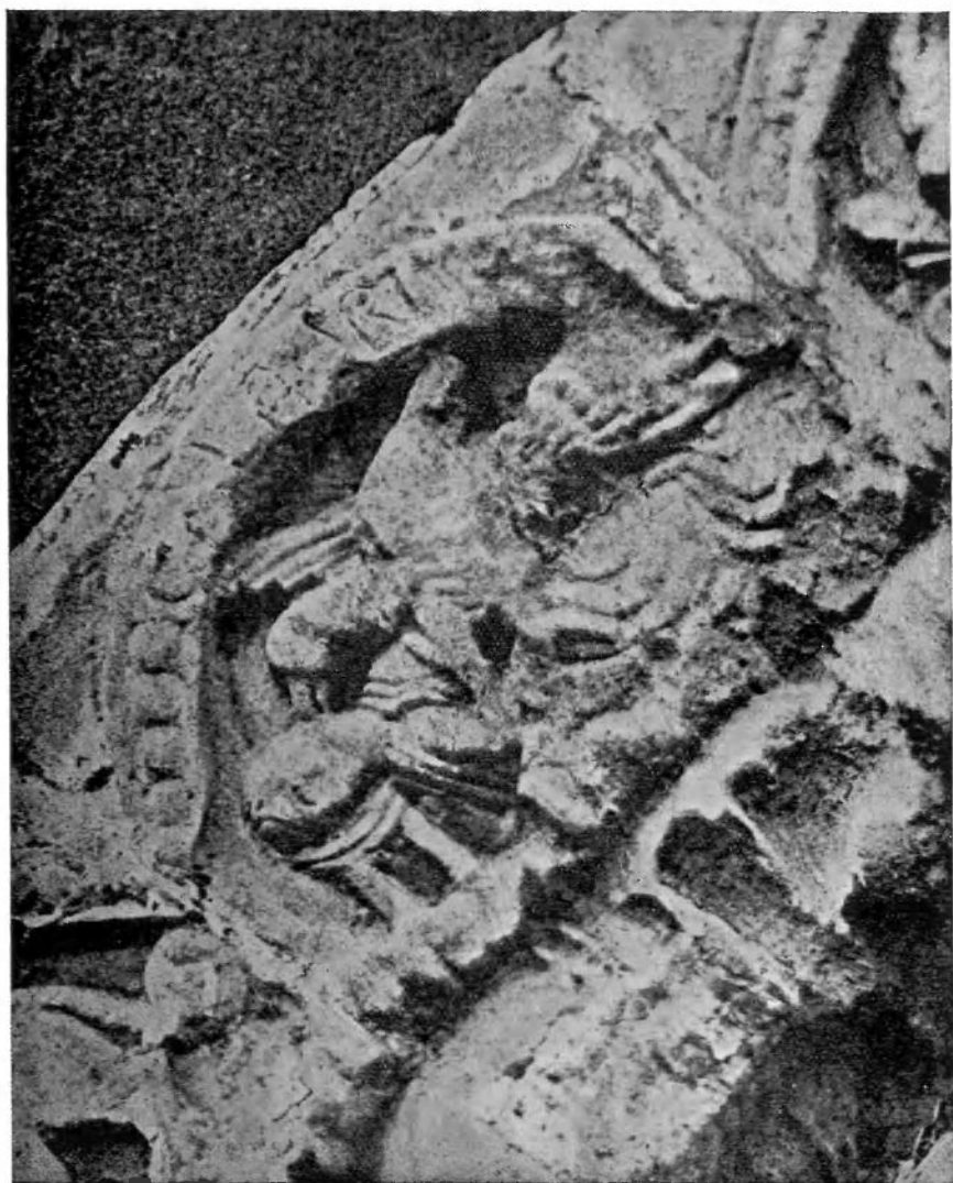
THE CALADRIUS ON THE SOUTH DOORWAY OF ALNE CHURCH, YORKS. ENLARGED.