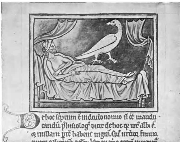
NO. 1. CALADRIUS FORETELLING RECOVERY (MS. 12 C xix, B.M.).