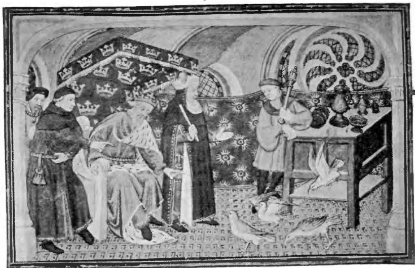
NO. I. ALEXANDER AND THE MARVELLOUS BIRDS (MS. 20 B xx, B.M.).