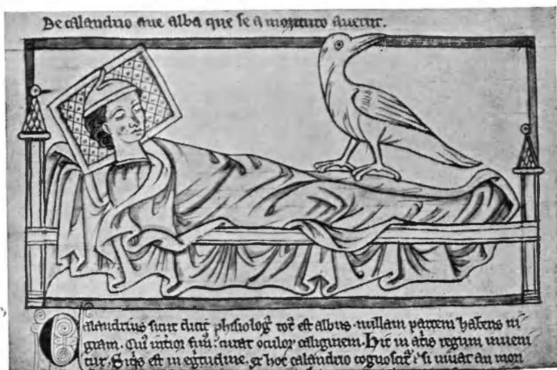
NO. 2. CALADRIUS FORETELLING DEATH (MS. Harl. 3244, B.M.).