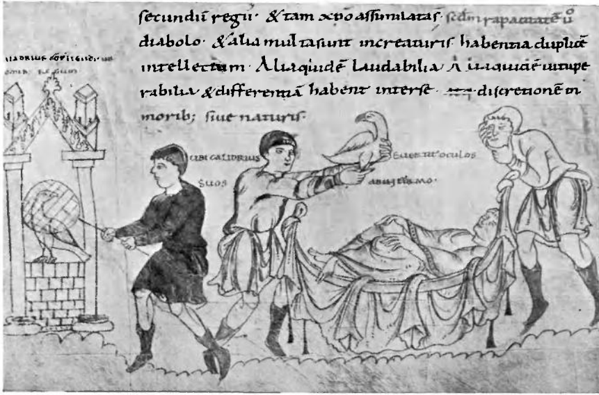
NO. 2. CALADRIUS FORETELLING DEATH (MS. 10074, Bibl. Roy. Brussels).