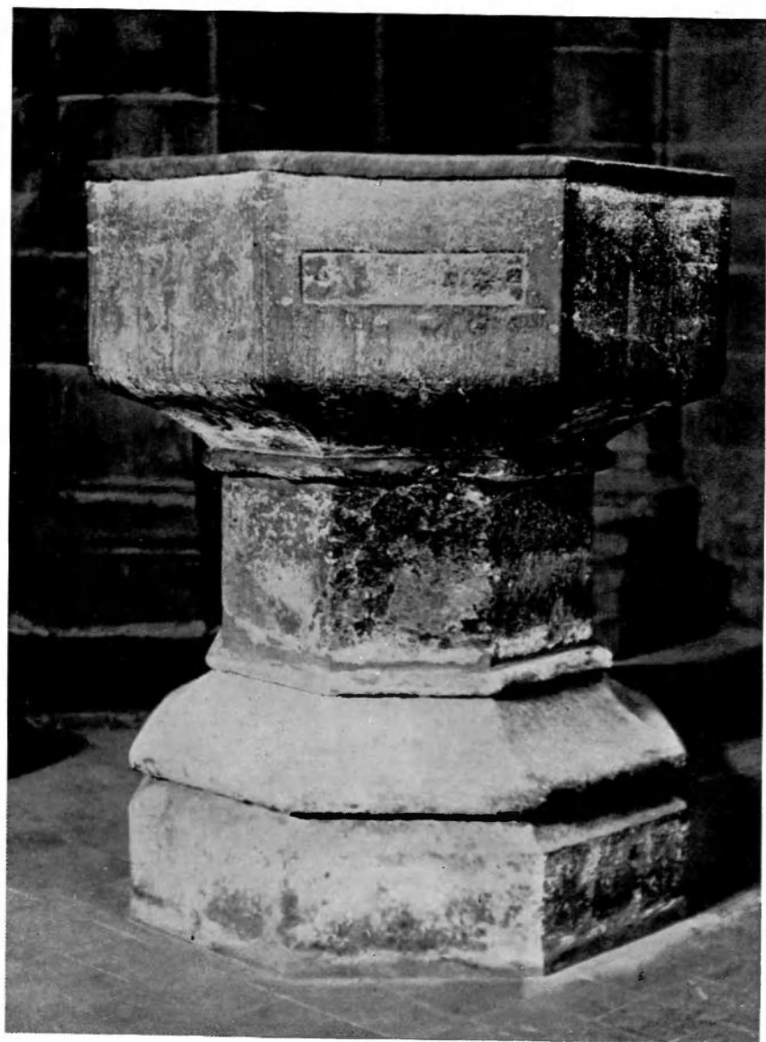
FONT IN THE PRIORY CHURCH OF ST. BARTHOLOMEW-THE-GREAT, WEST SMITHFIELD.