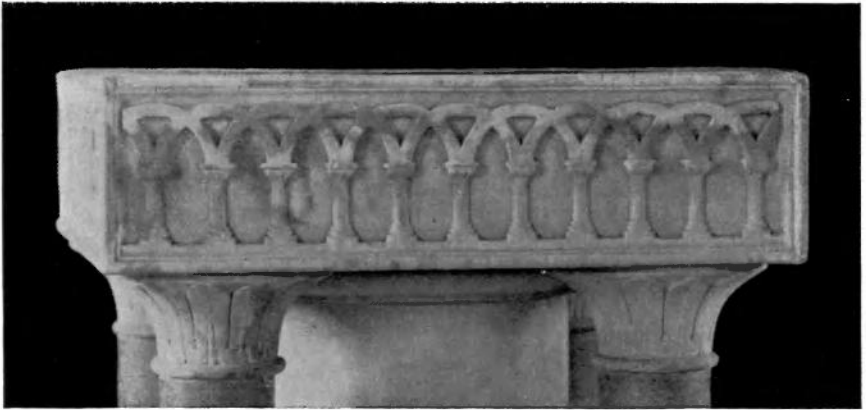
NO. 1. FONT AT ST. DUNSTAN'S, STEPNEY.