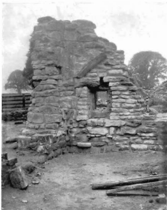
B. HATCH TO KITCHEN, FROM SUB-VAULT OF REFECTORY