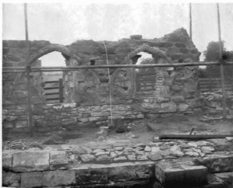
B. SOUTH WINDOWS OF SUBVAULT OF REFECTORY