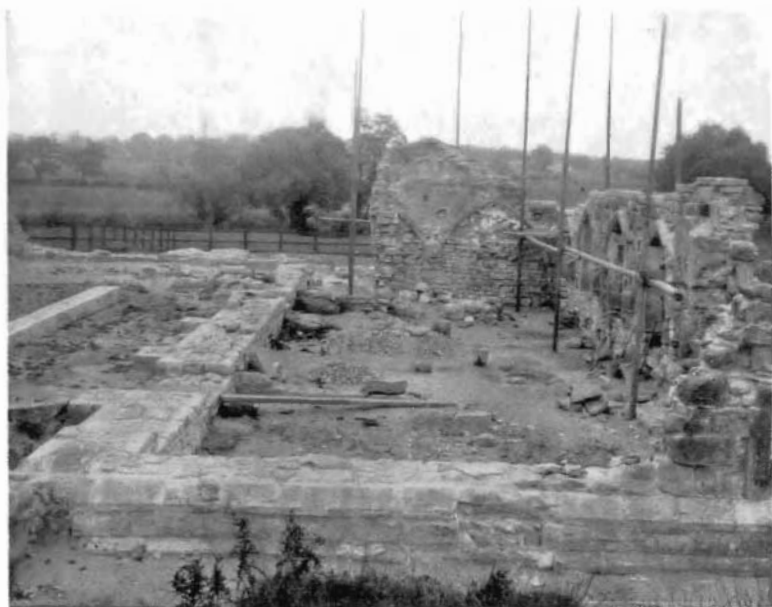
A. MATTERSEY PRIORY : THE REFECTORY FROM THE WEST