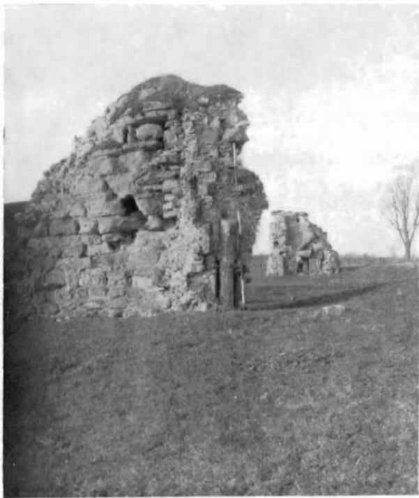
A. REFECTORY : PART OF WEST WALL