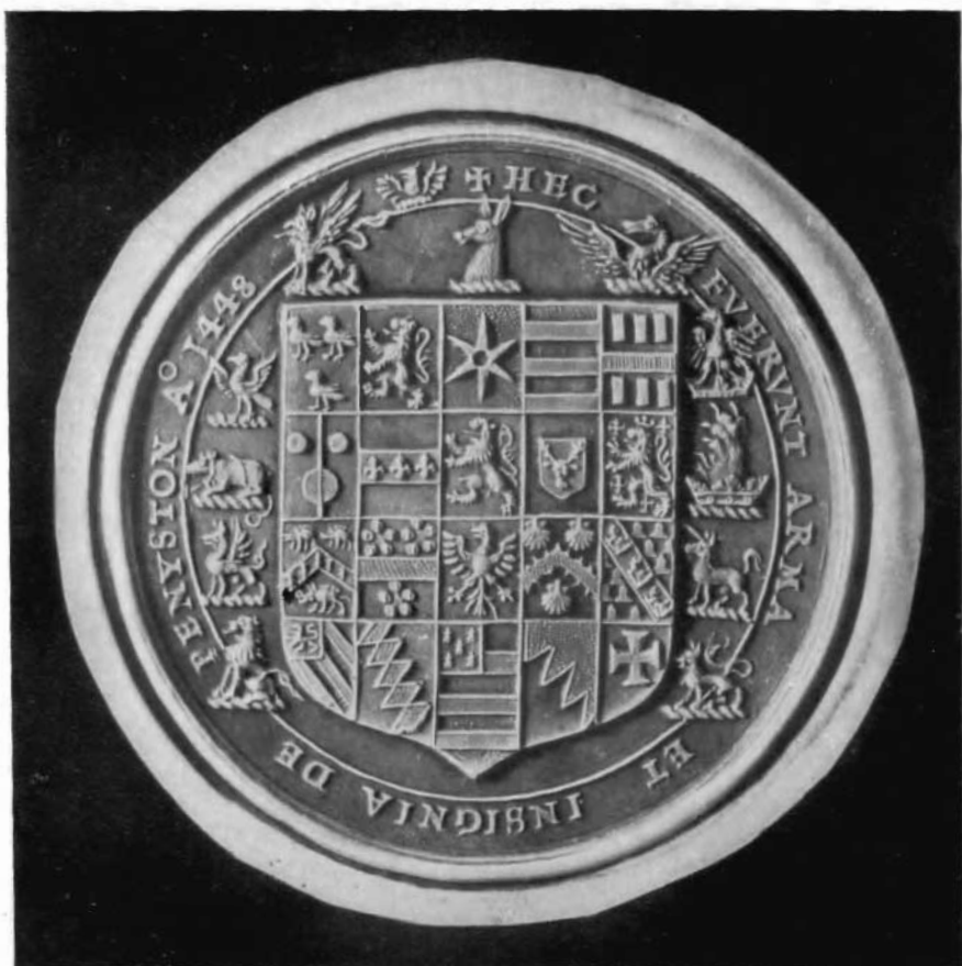
THE PENYSTON SEAL, IMPRESSION (Scale nearly \frac{1}{2} )