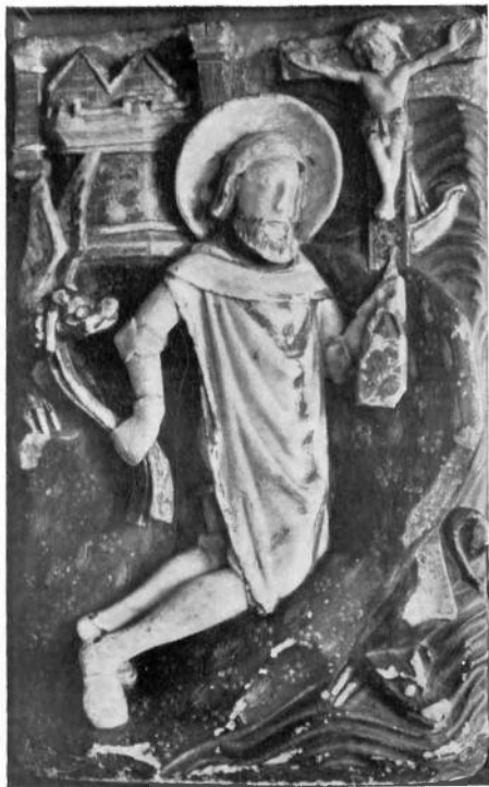
A. ST. ARMEL. AN ALABASTER PANEL NOW AT STONEYHURST COLLEGE