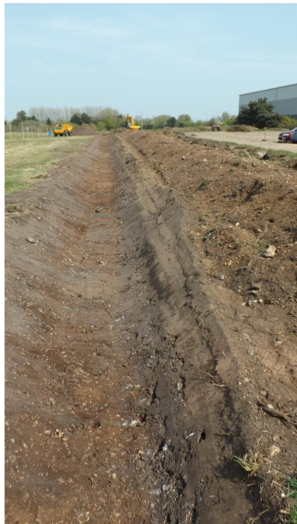
Plate 8. Ditch re-cut along northern boundary