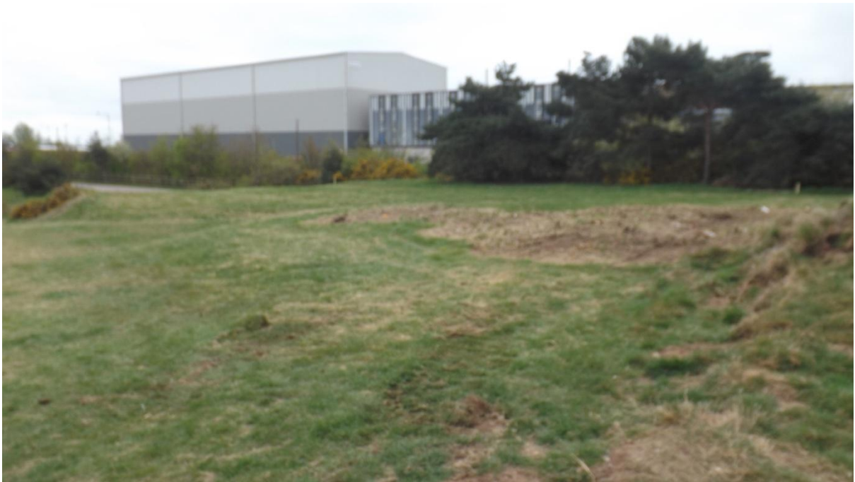
Plate 1. Pre-excavation, from the north-west