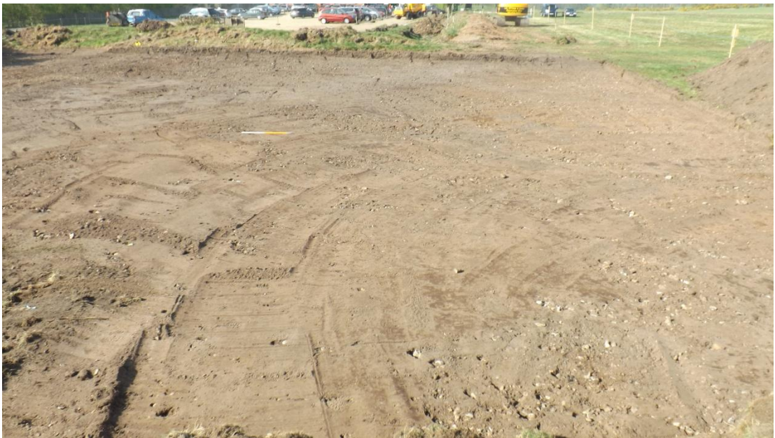
Plate 6. Stripped area from the east