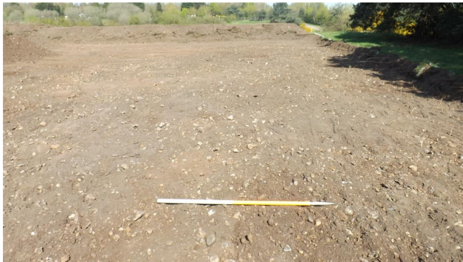
Plate 4. (1001) from the west