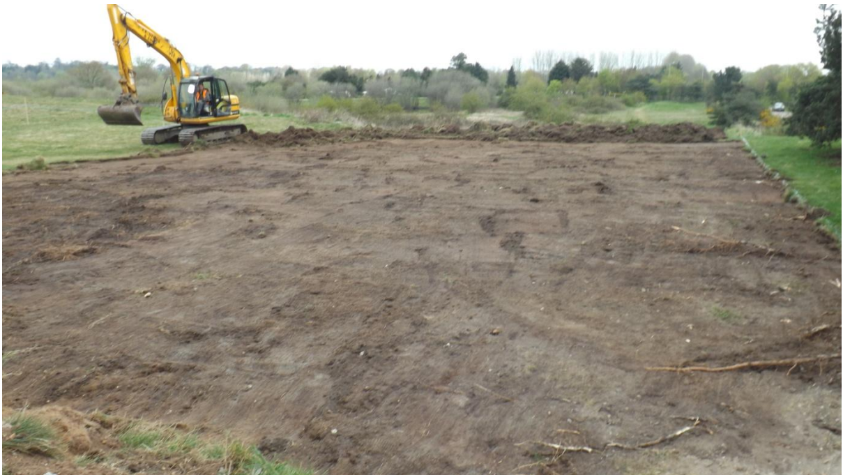
Plate 2. Mid-excavation of car park area, from the west