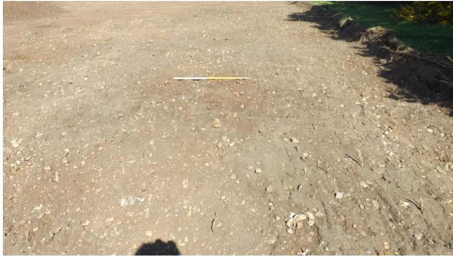
Plate 3. Post-excavation showing surface (1001), from the west