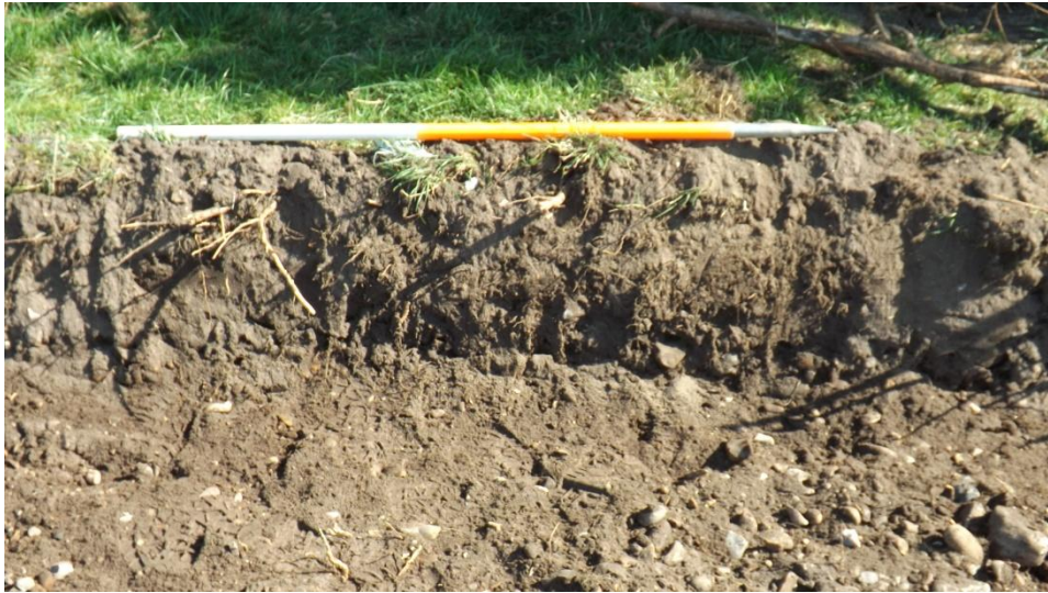
Plate 5. Sample section