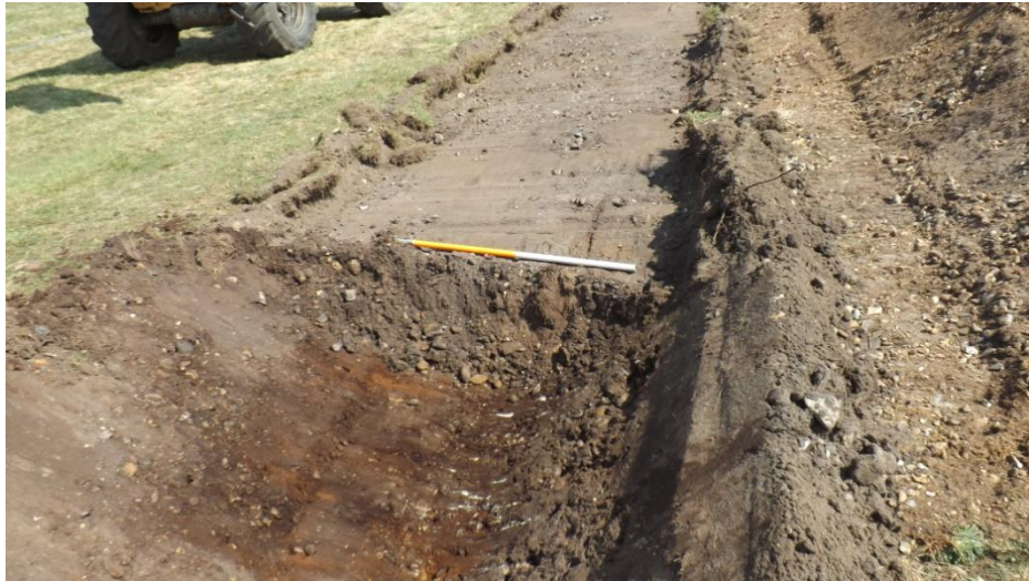
Plate 7. Ditch re-cut from the west