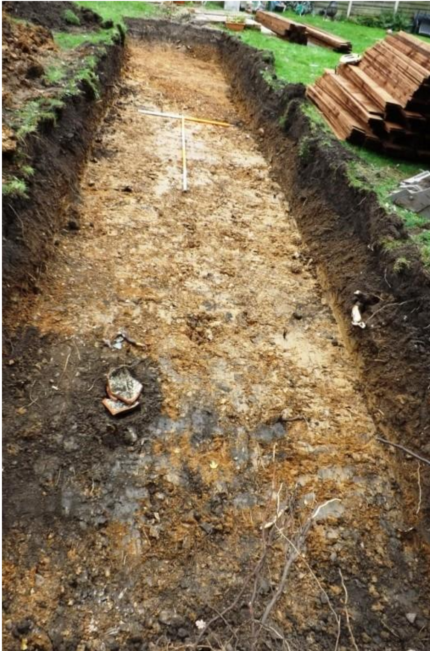
Plate 3. Post-excavation view of trench, looking south-east (Nineteenth century rubbish pit in foreground)