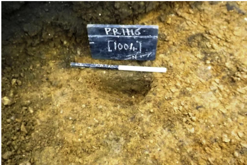
Plate 2. Post hole [1004]