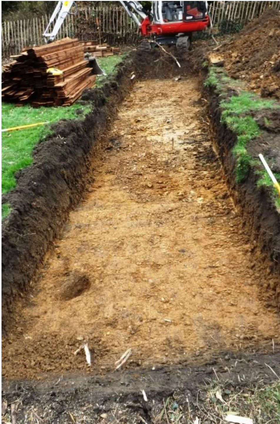
Plate 4. Post-excavation view of trench , looking north-west (post hole in foreground)