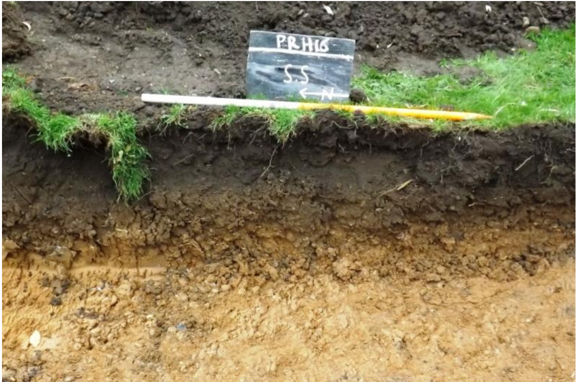
Plate 5. Trench sample section