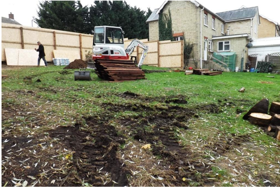
Plate 1. Pre-excitation of site