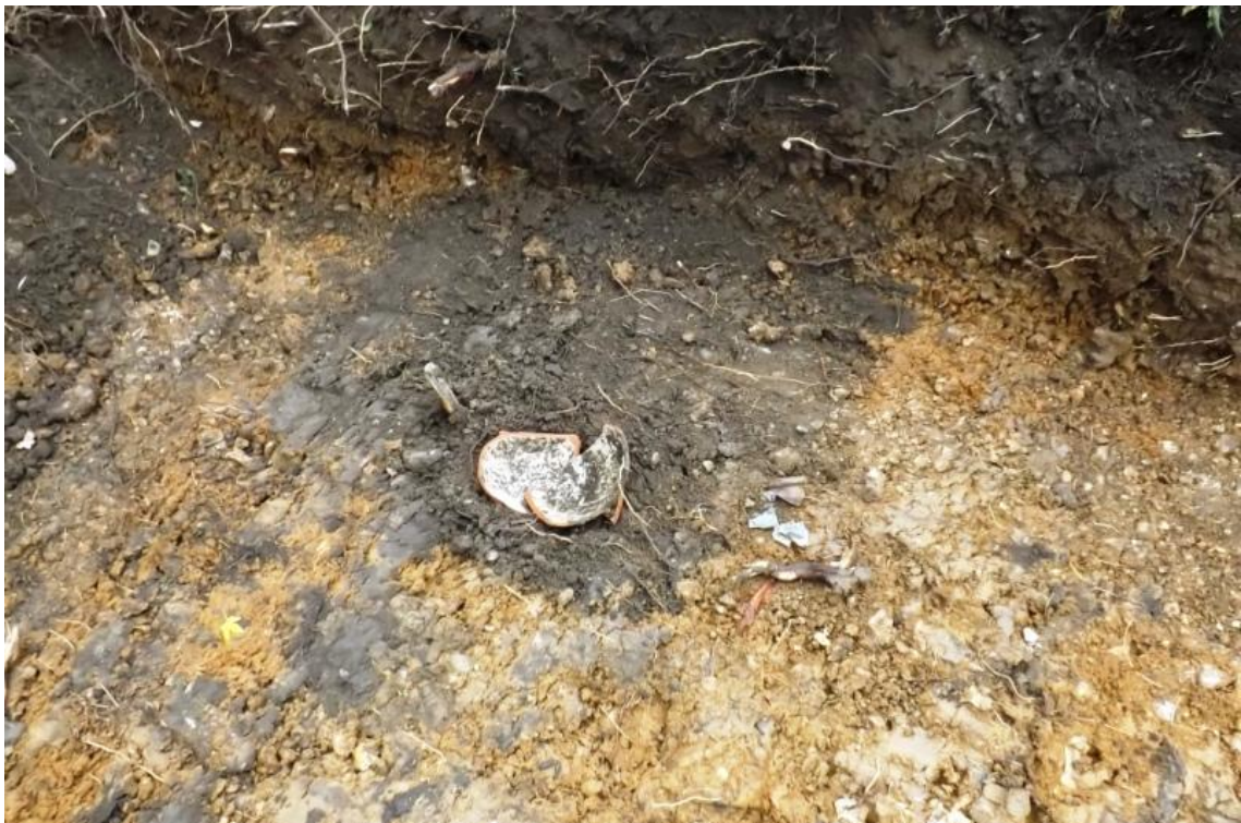
Plate 6. Nineteenth century rubbish pit with glazed Victorian ware