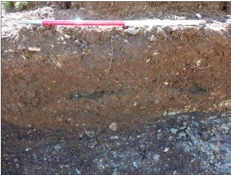
Pl. 3 General view of section showing deposit sequence. 1m scale. Looking southeast.