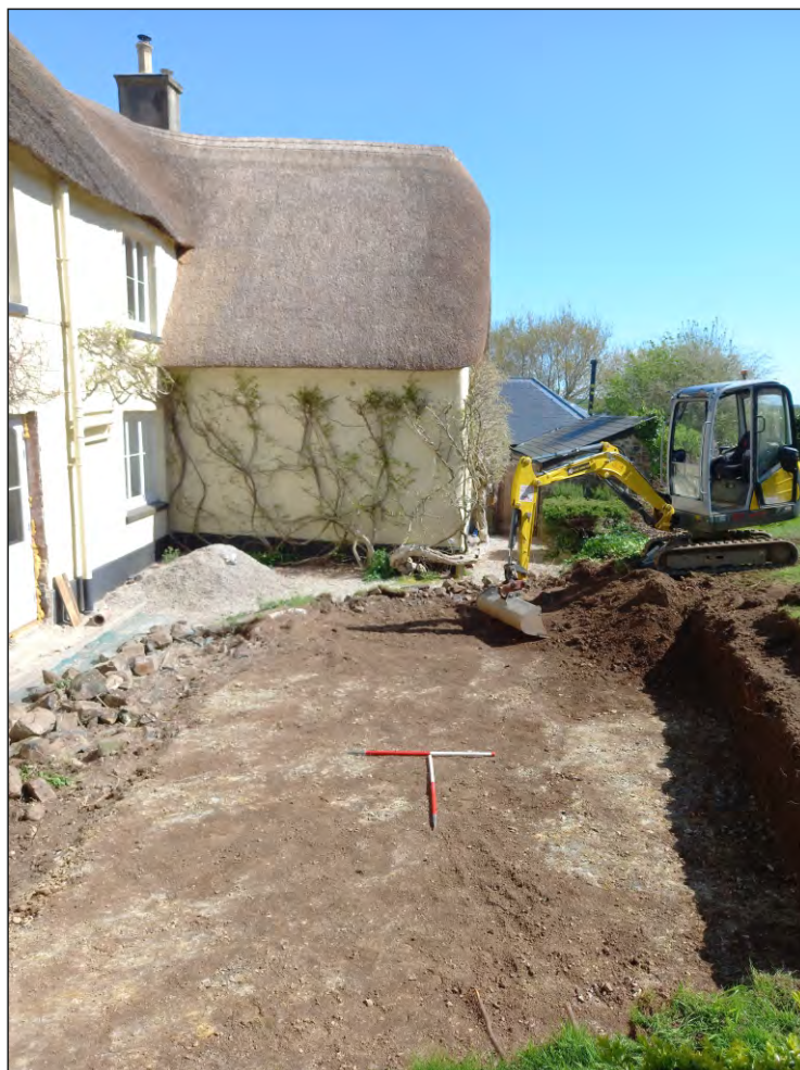
Pl. 2 General view of reduced area showing shillet (103) at the base of the excavations. 1m scales. Looking northeast.