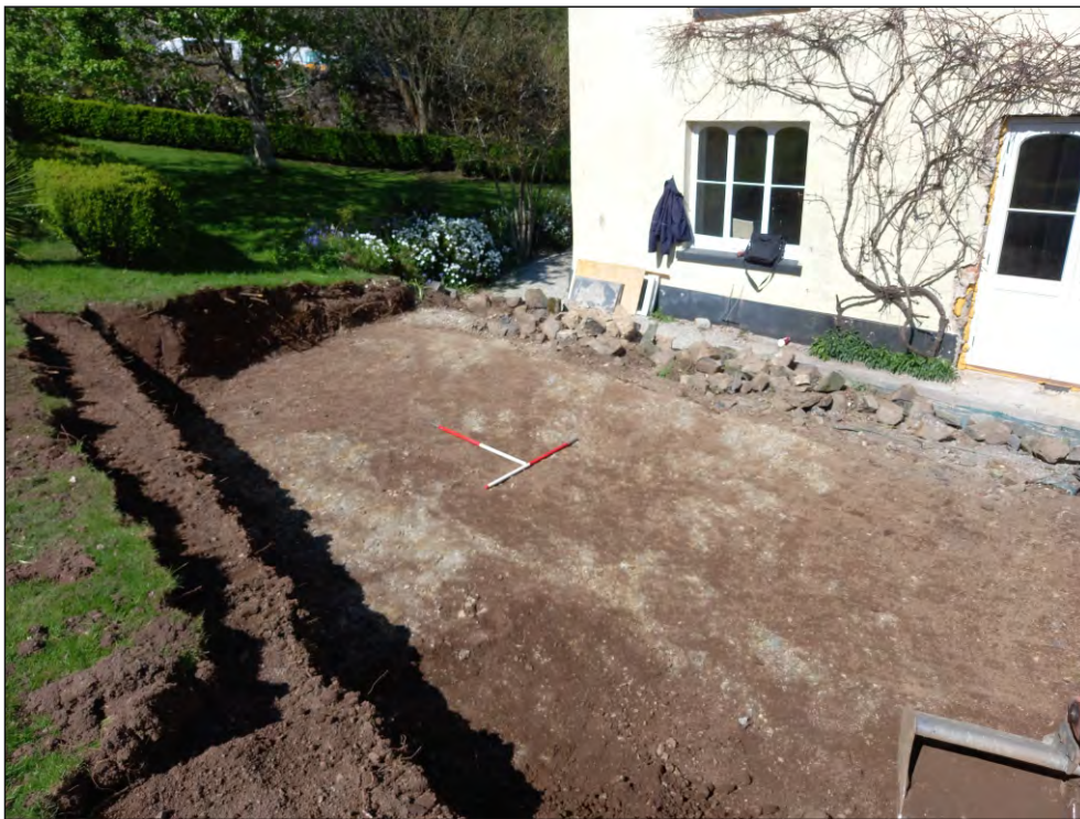
Pl. 1 General view of reduced area showing shillet (103) at the base of the excavations. 1m scales. Looking northwest.