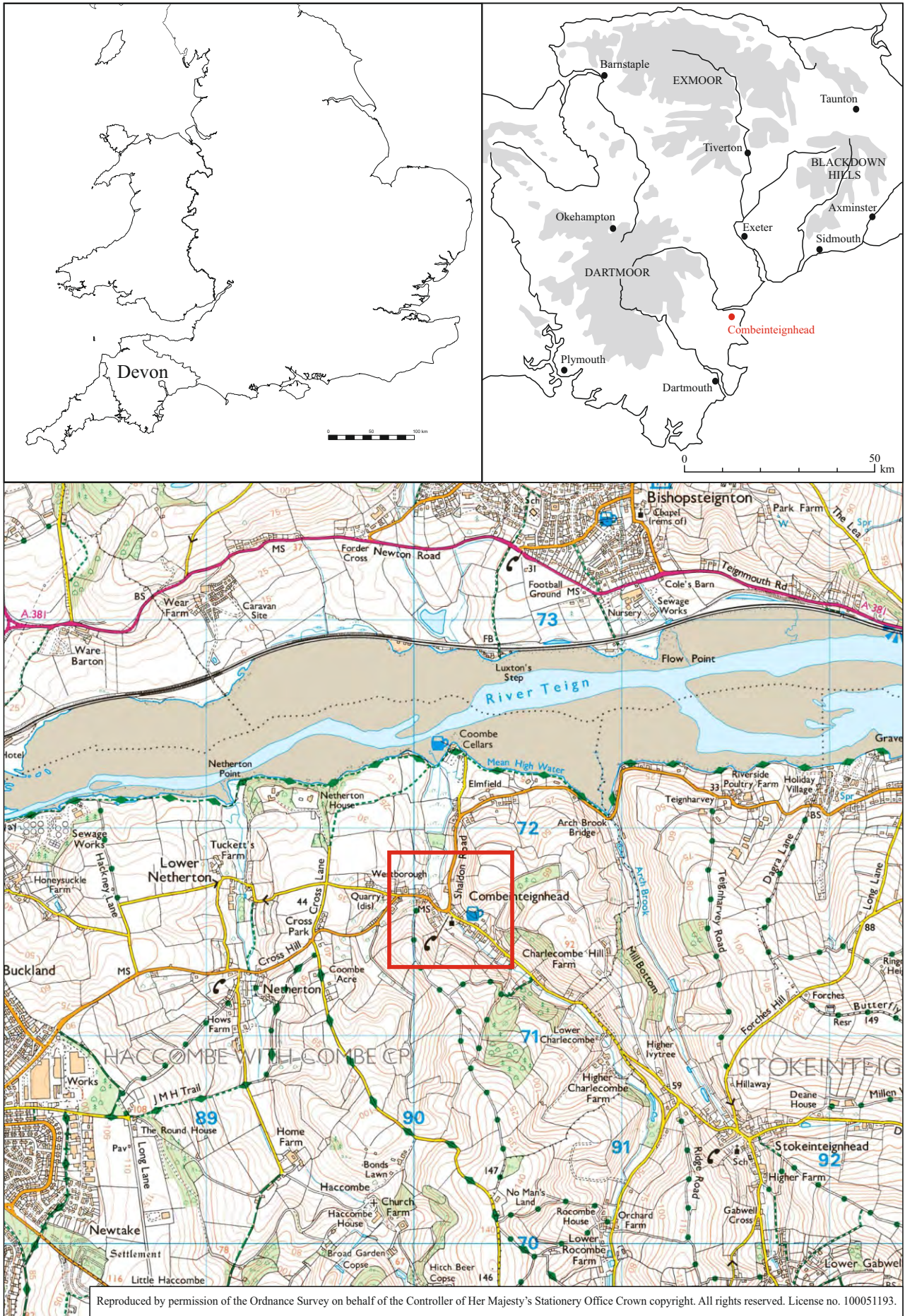
Fig. 1 Location of site.