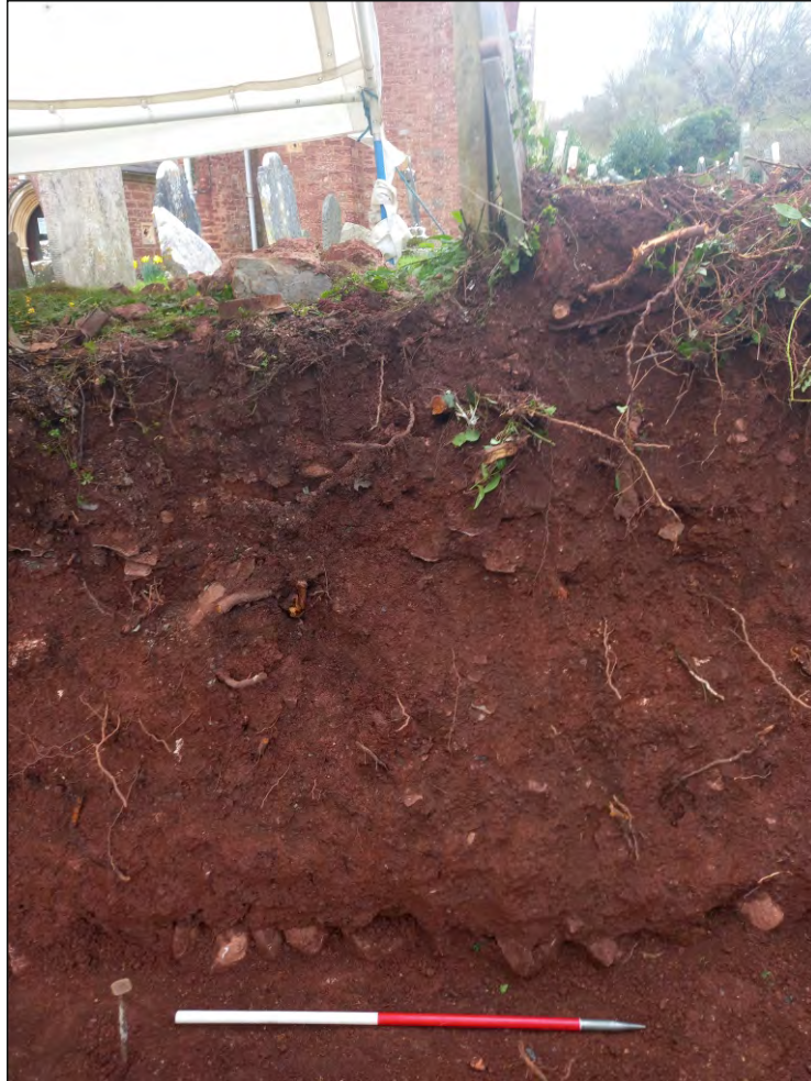
Pl. 3 Close-up showing possible remains of cobbled surface (100) at base of section. 1m scale. Looking southeast.