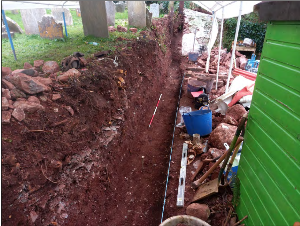
Pl. 1 General view of graveyard section showing successive dumps of material (101-112) against the former boundary wall. 2m scale. Looking southwest.