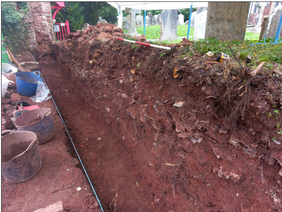
Pl. 2 General view of graveyard section showing successive dumps of material (101-112) against the former boundary wall. 2m scale. Looking northeast.