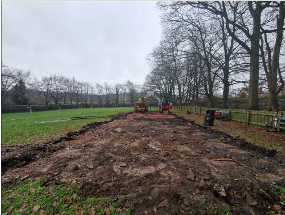
Pl. 1 General view of the excavation area showing depth of topsoil (100) above natural subsoil (102). 2m scales. Looking east.