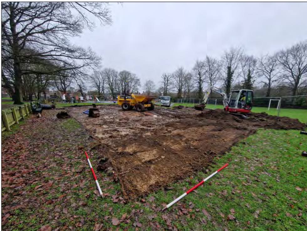
Pl. 2 General view of the excavation area showing depth of topsoil (100) above natural subsoil (102). 2m scales. Looking northwest.