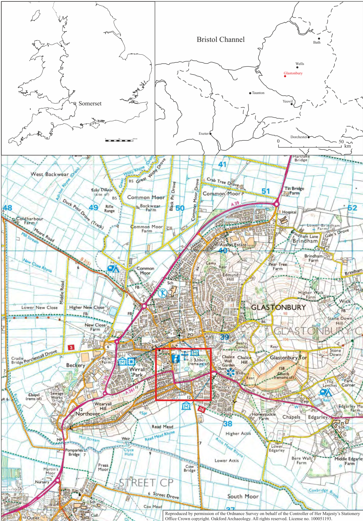
Fig. 1 Location of site.