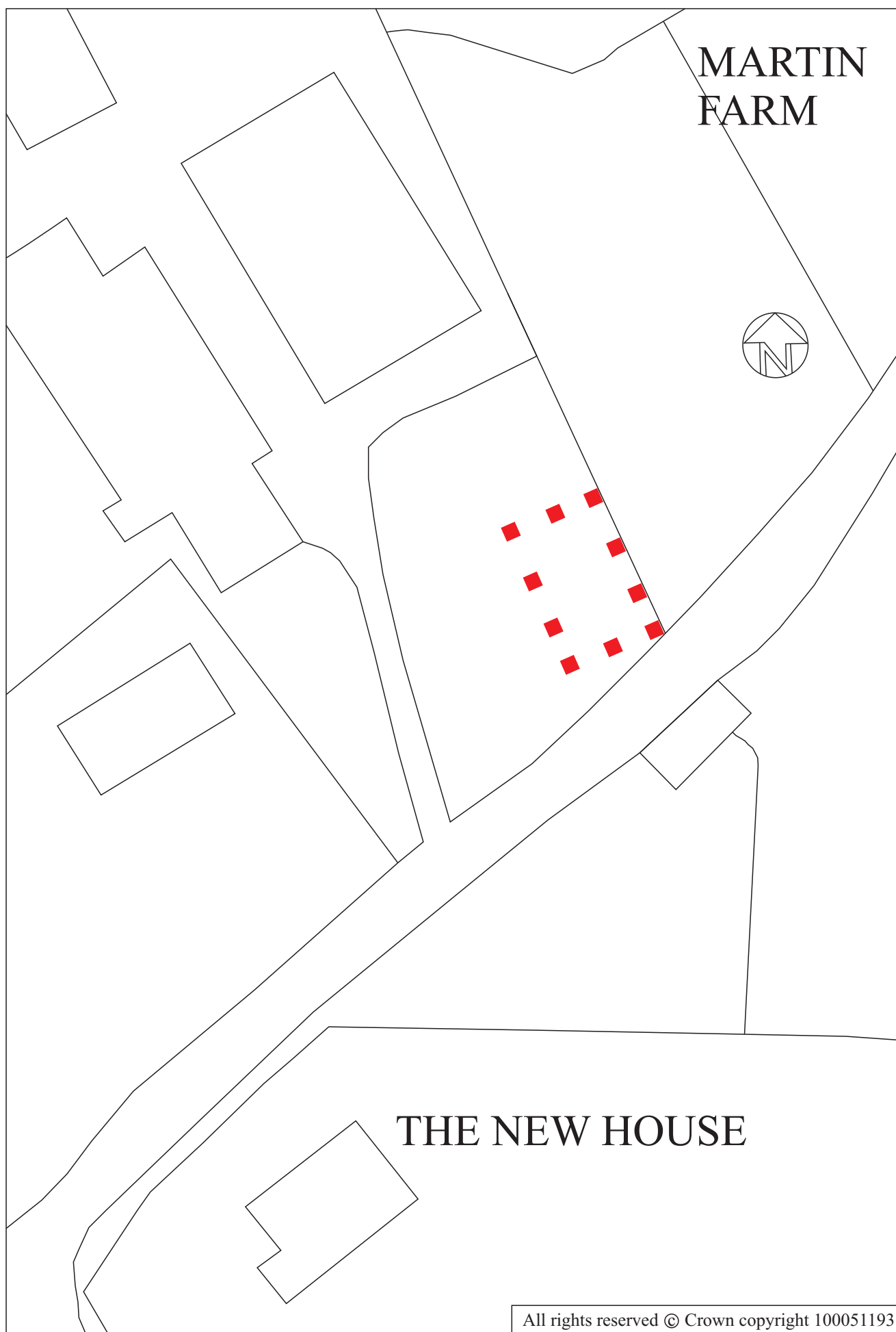
Fig. 2 Location of observations