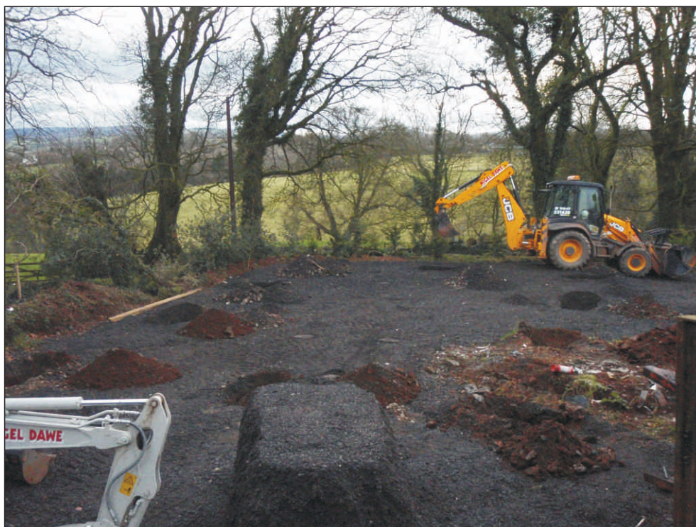
Pl. 1 General view of site showing foundation pits. Looking north.