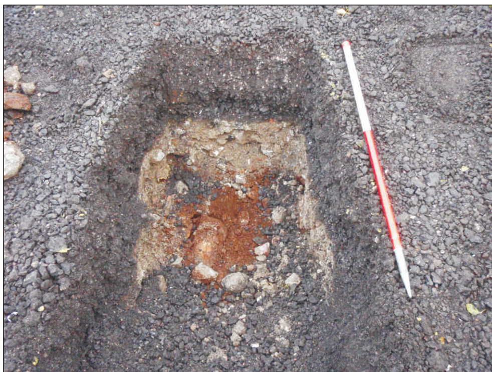
Pl. 2 Close-up view of foundation trench showing top of soil horizon below base of foundation. 1m scale. Looking north.