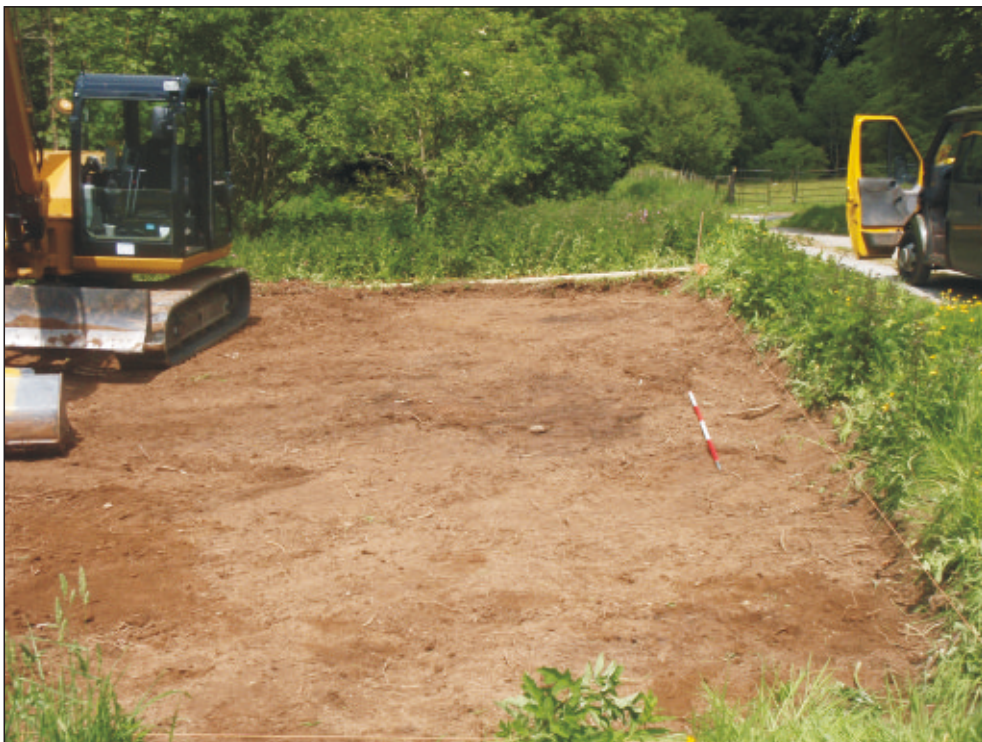
Pl. 4 General view of cut-and-fill area. 2m scale. Looking north.