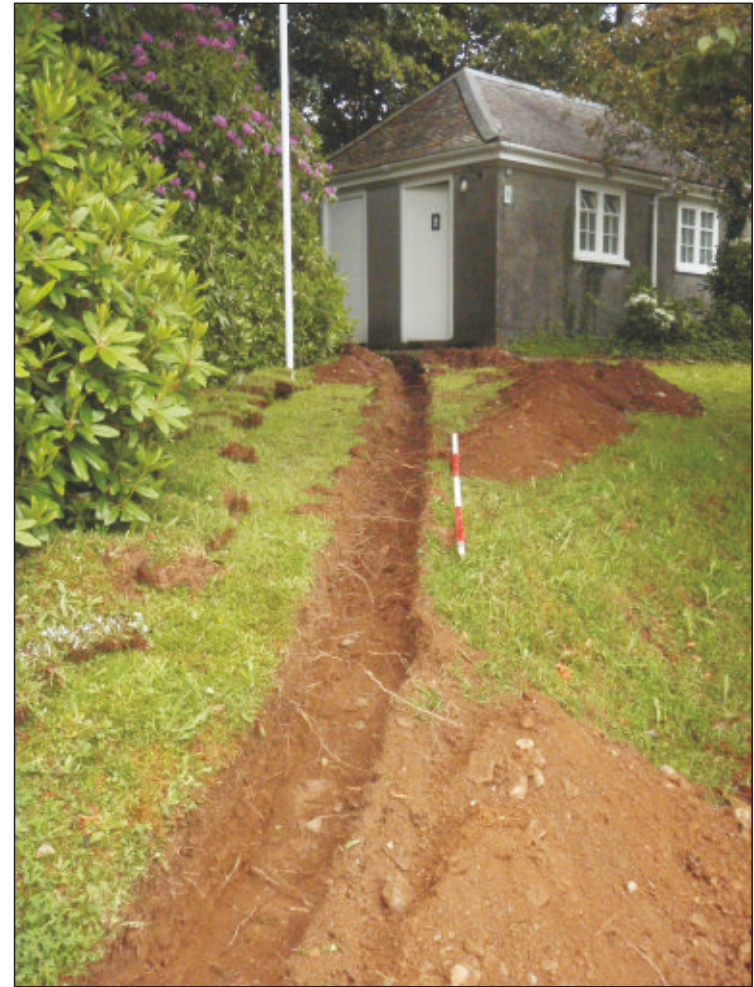
Pl. 2 General view of trenching. 2m scale. Looking east.