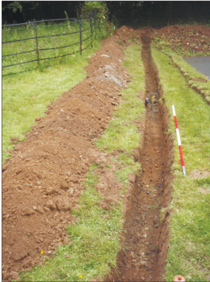
Pl. 1 General view of trenching. 2m scale. Looking northeast.