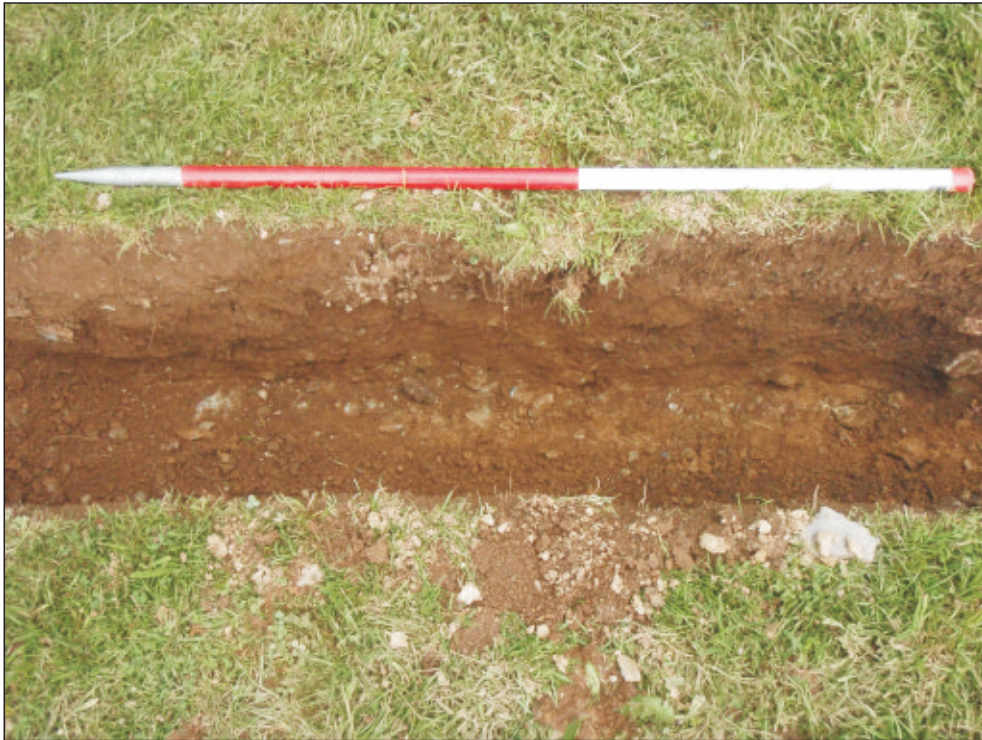
Pl. 3 Sample section showing depth of topsoil (100) and subsoil (101). 1m scale. Looking northwest.