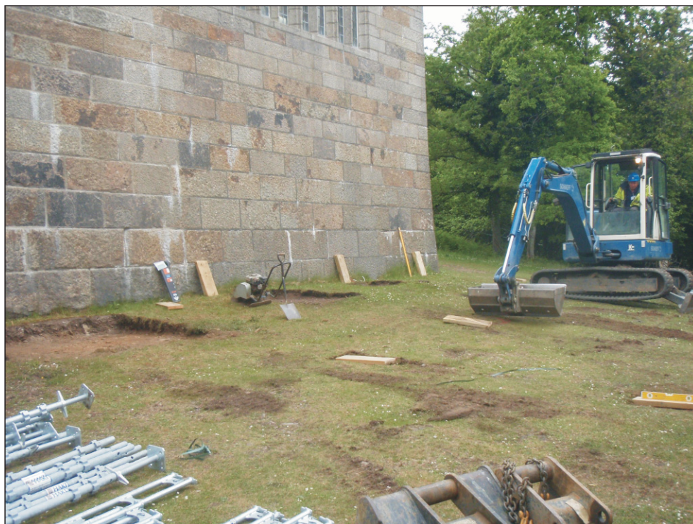
Pl. 1 General view of scaffold bases. Looking east.