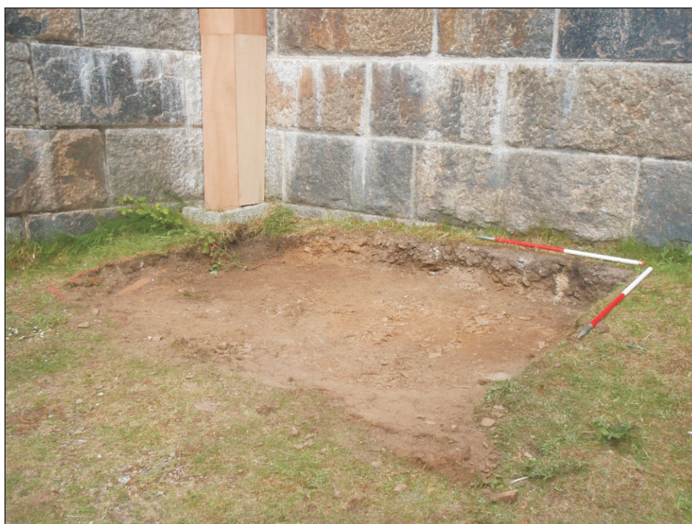
Pl. 2 Close-up view of scaffold loading bay base to the east of chapel. 1m scale. Looking northeast.