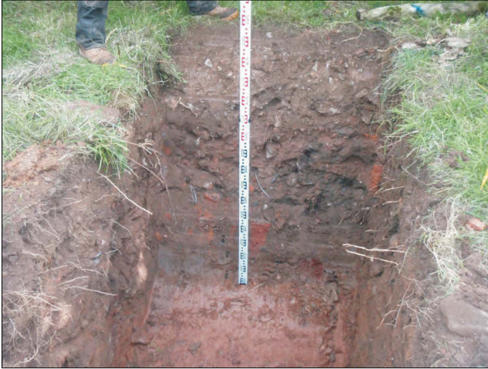
Pl. 3 Section through reed bed system showing typical deposit sequence. Looking north.