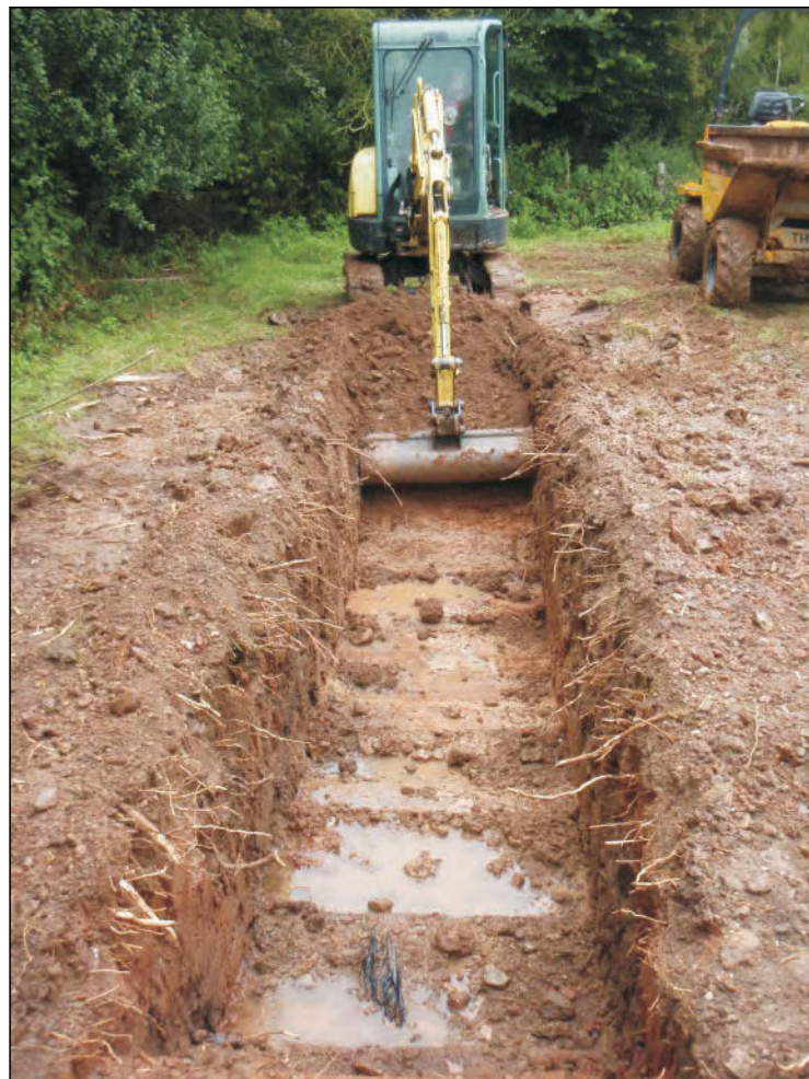
Pl. 2 General view of reed bed system showing depth of trenching. Looking northeast.