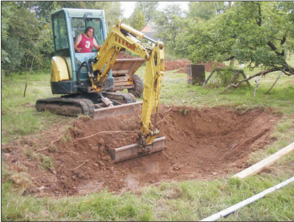
Pl. 1 General view of pond showing depth of excavations. Looking northeast.