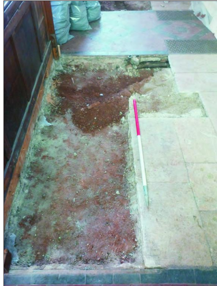
Pl. 2 General view of groundworks, south nave. 1m scale. Looking north.