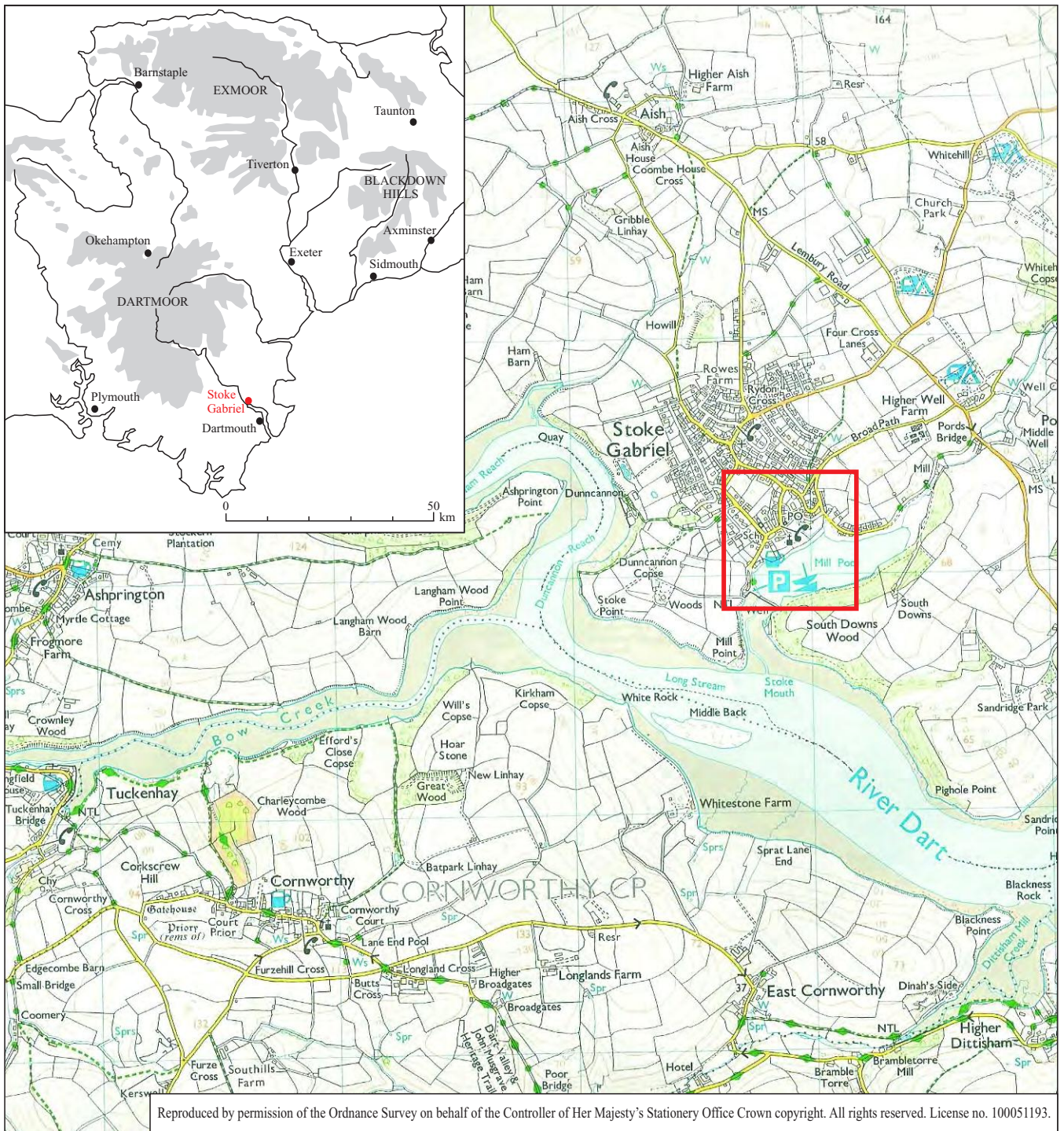
Fig. 1 Location of site.