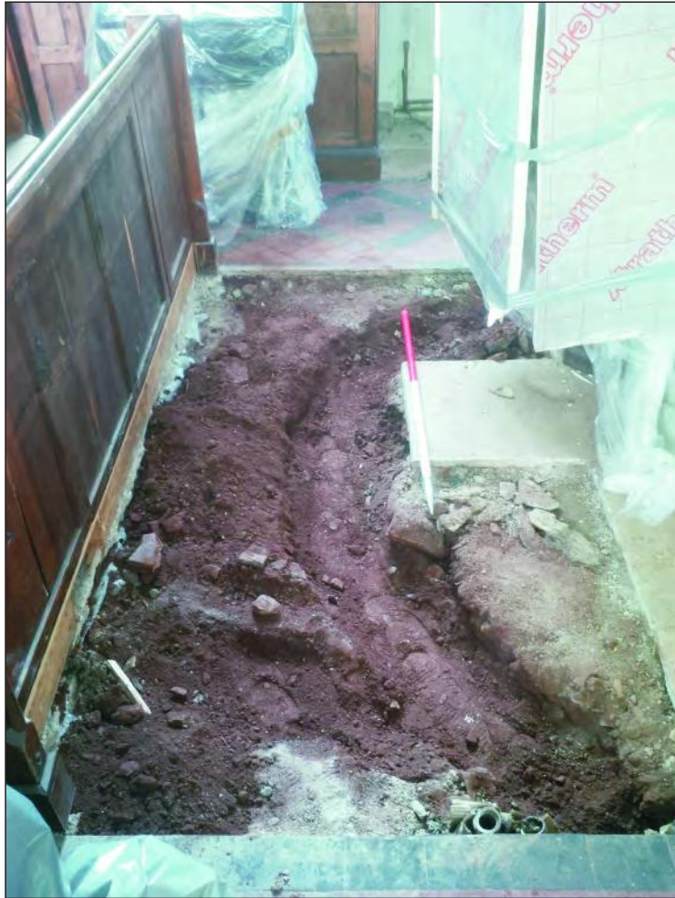
Pl. 1 General view of groundworks, north nave. 1m scale. Looking north.