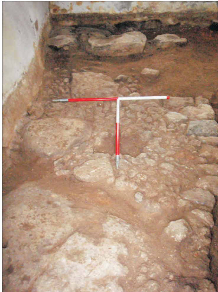
Pl. 1 General view of floor, Shippon. 1m scale. Looking south.