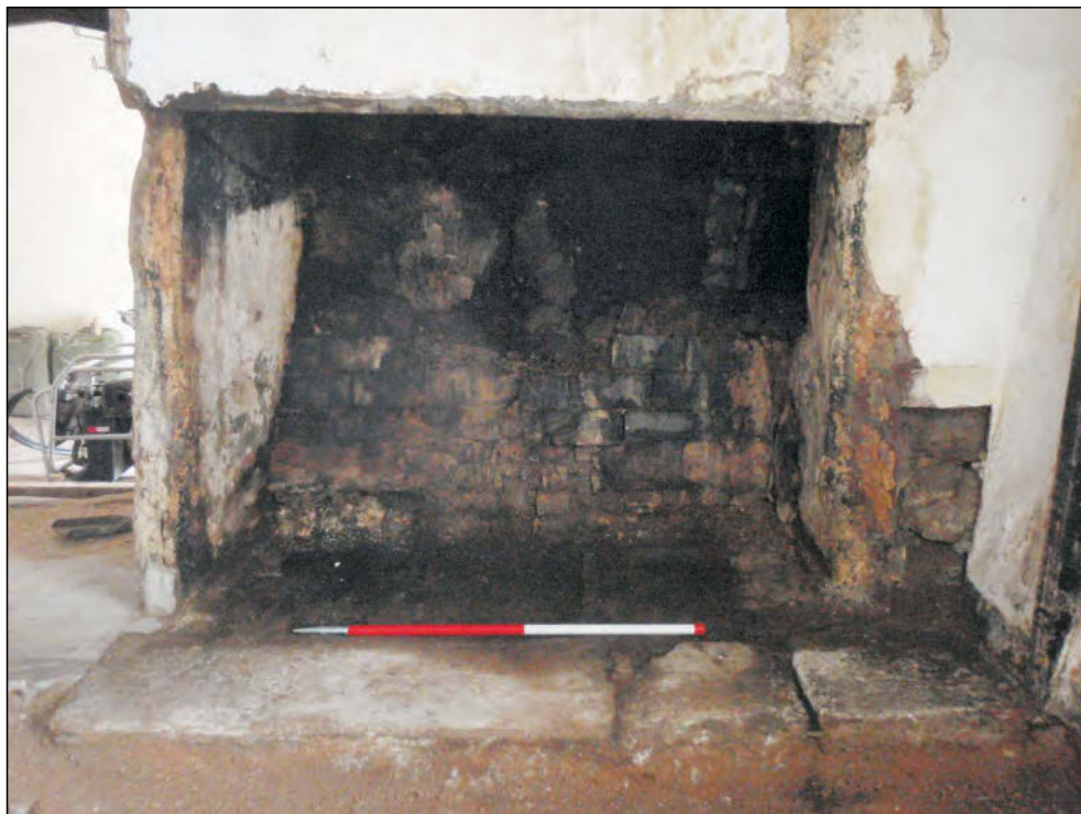
Pl. 2 General view of fireplace, Hall. 1m scale. Looking east.