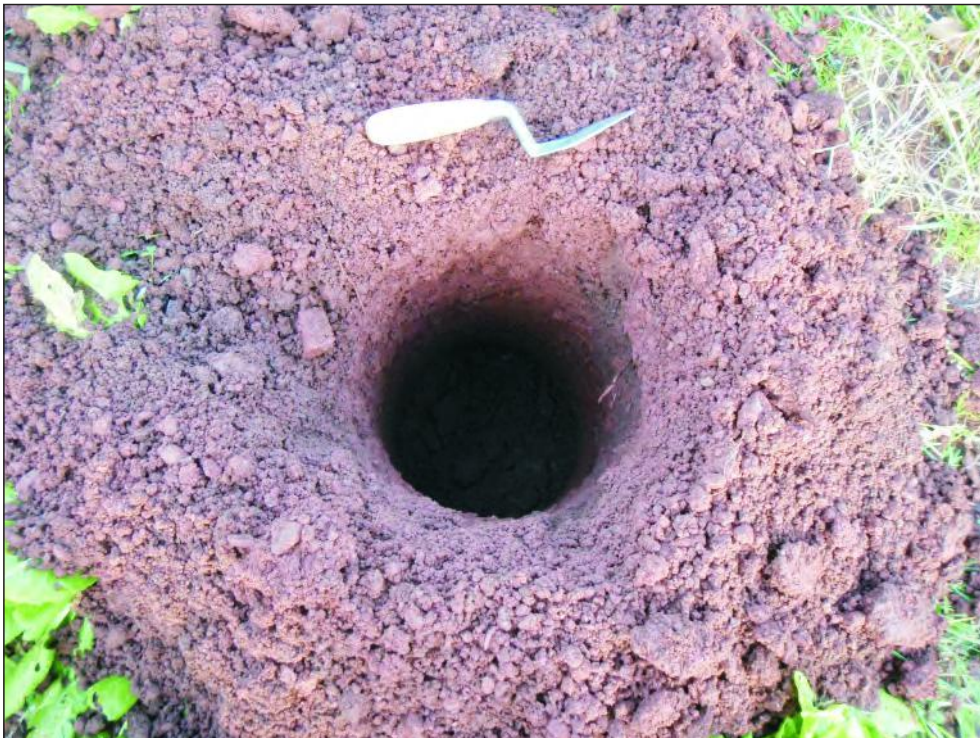
Pl. 2 Close-up of auger hole showing relative depth.