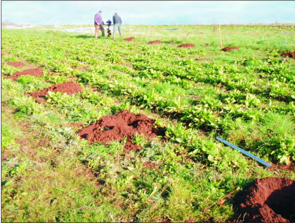
Pl. 1 General view of augering. Looking northeast.