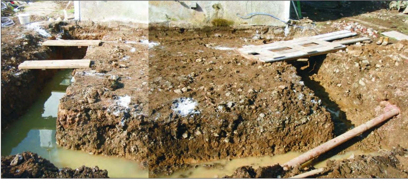
Pl. 1 General view of extension showing depth of deposits. Looking east.