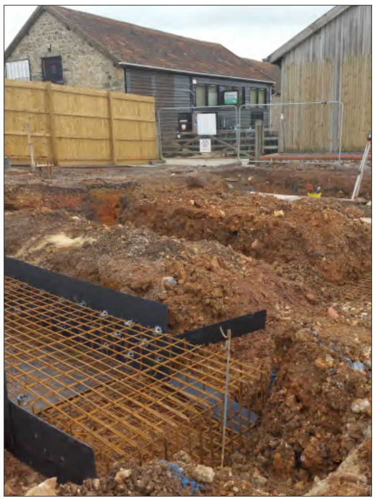
Pl. 1 General view of new restaurant area showing depth of foundations through modern made ground. Looking northeast.