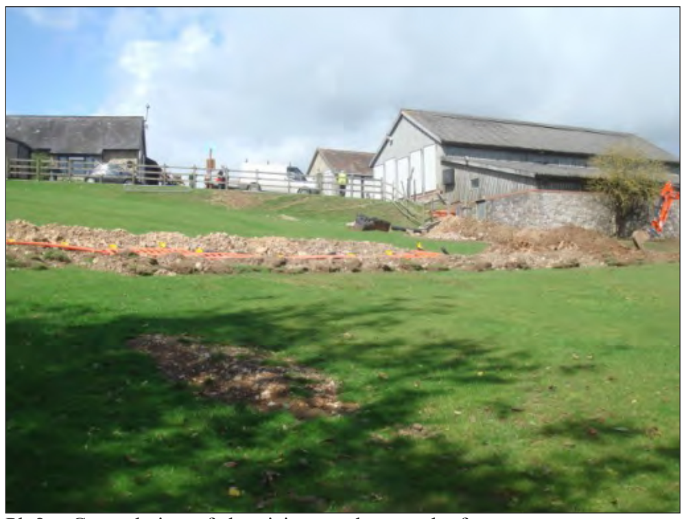
Pl. 2 General view of electricity trench to south of new restaurant area. Looking north.