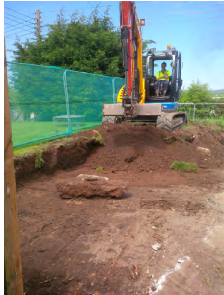
Pl. 2 General view of access road excavations showing shallow nature of works. Looking north.