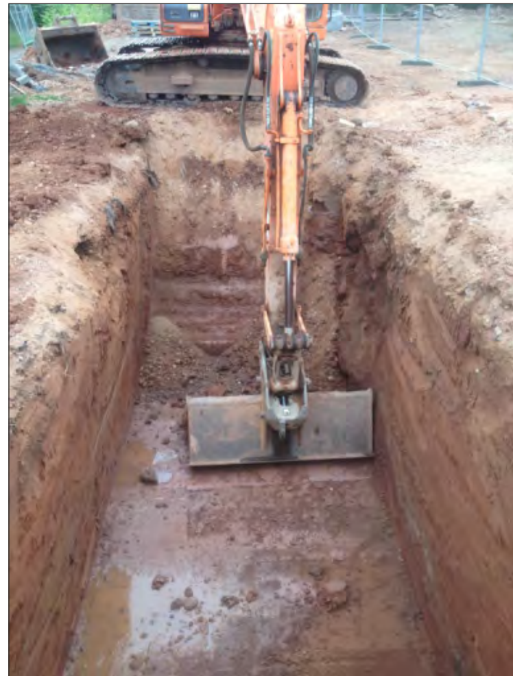
Pl. 4 General view of attenuation tank excavations. Looking west.