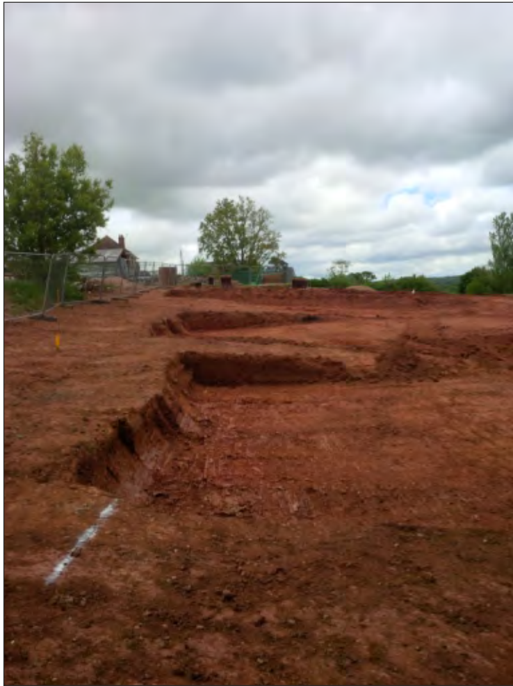
Pl. 1 General view of building foundations. Looking east.