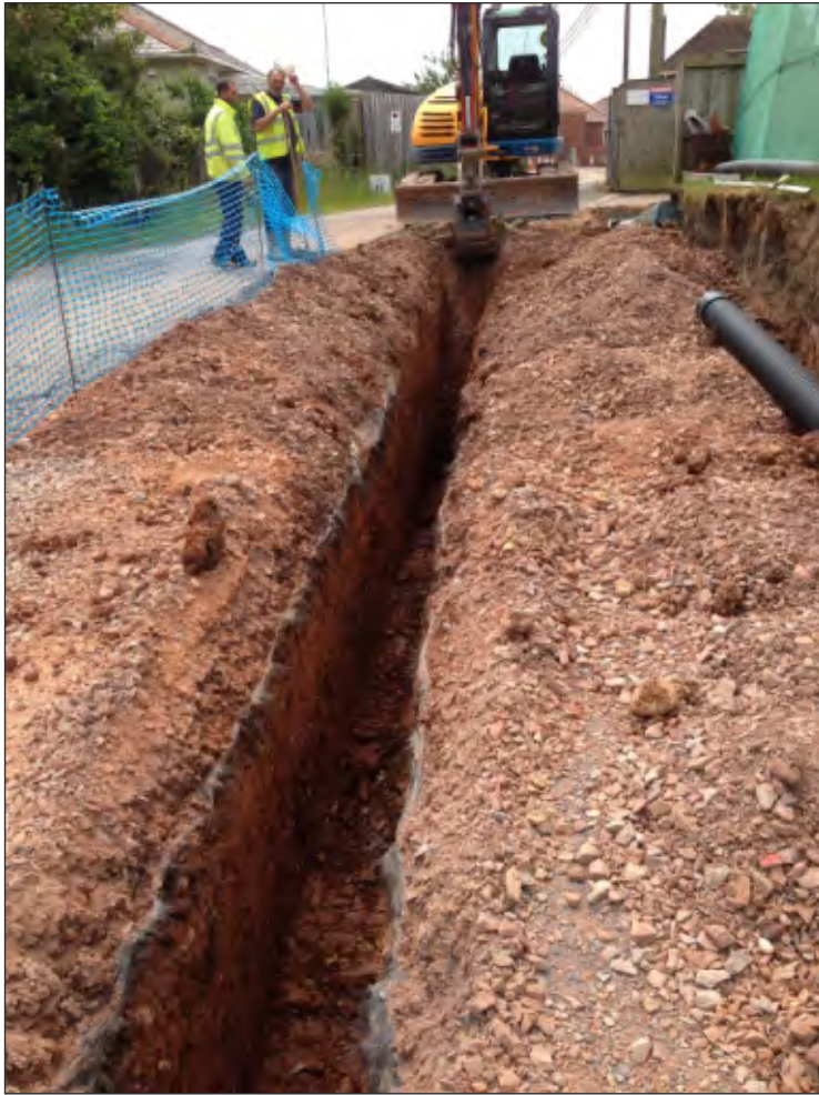
Pl. 3 General view of service trenching. Looking south.