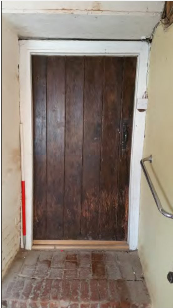
Pl. 1 External view of late 19th-early 20th century pegged doorway. 1m scale. Looking south.