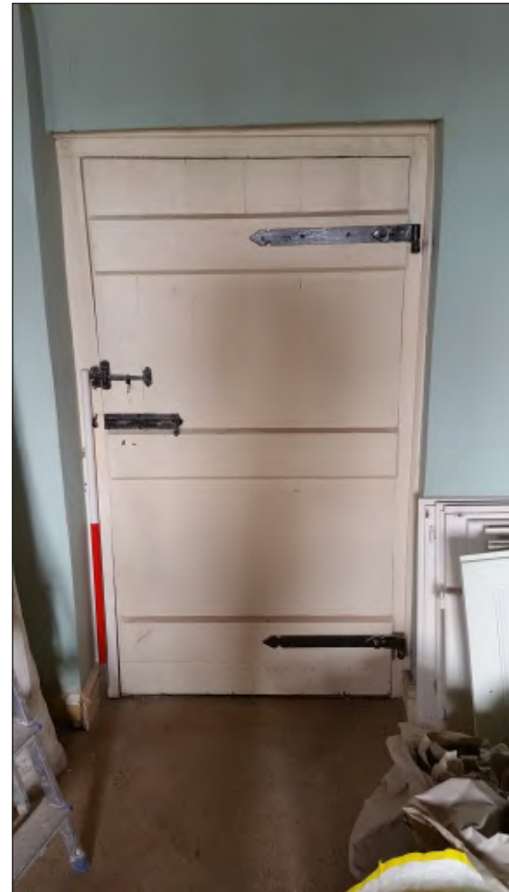
Pl. 2 Internal view of late 19th-early 20th century pegged doorway. 1m scale. Looking north.