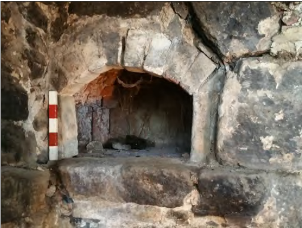
Pl. 4 Close-up of later bread-oven showing detail of brickwork. 0.25m scale. Looking north.