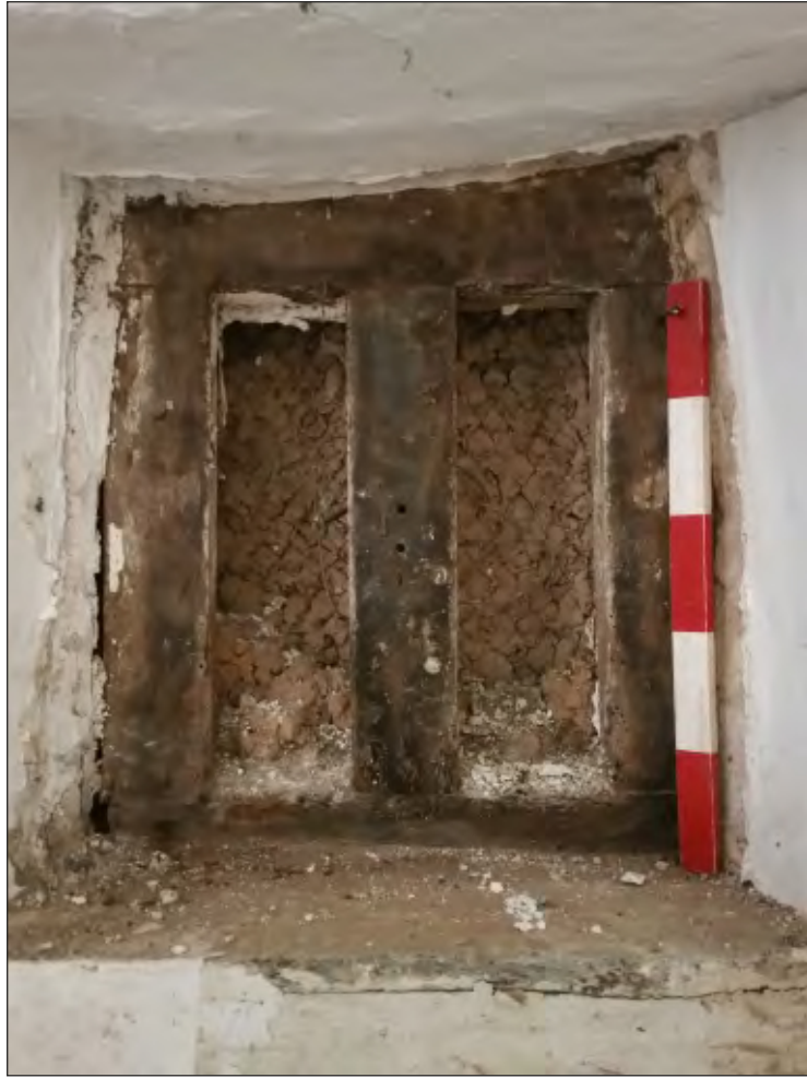
Pl. 5 Close-up of original 17th-century two-light window with pegged mortise-and-tenon joints. 0.5m scale. Looking east.