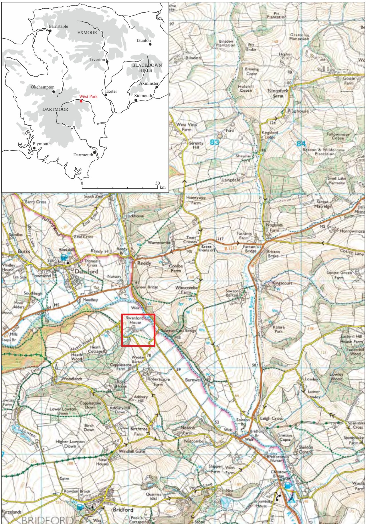
Fig. 1 Location of site.