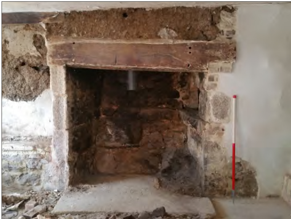
Pl. 2 General view of the original 17th-century fireplace. 1m scale. Looking west.