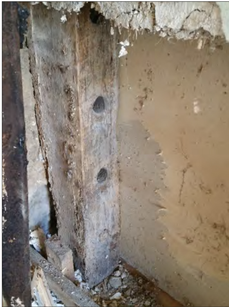
Pl. 1 Detail of close studded oak partition on ground-floor with original lathe holes. Looking northeast.