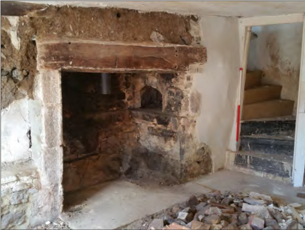
Pl. 3 General view of the original 17th-century fireplace with later bread-oven inserted into north side. 1m scale. Looking northwest.