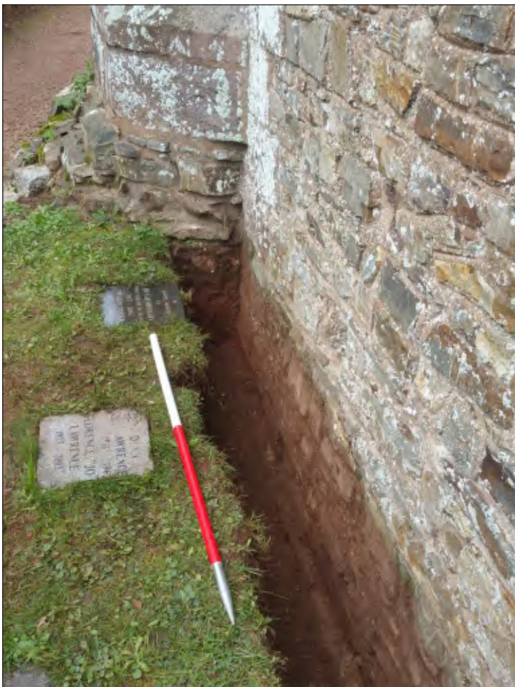
Pl. 1 General view of south aisle wall extending below level of charnel soil and tower stair turret with exposed foundation . 1m scale. Looking west