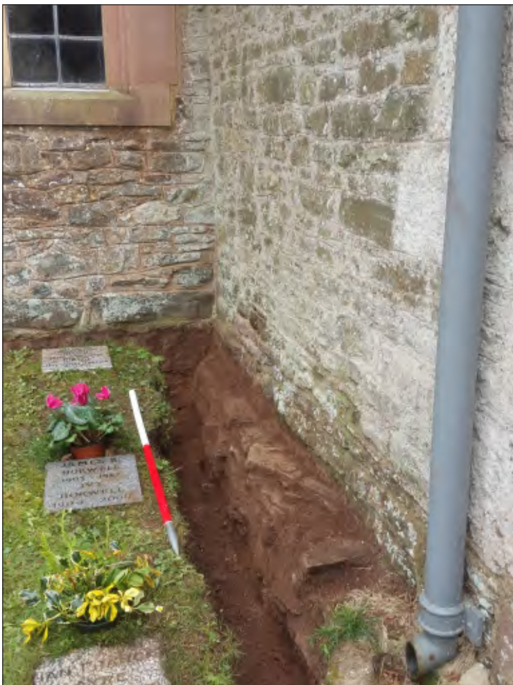
Pl. 3 General view of shallow foundations of later porch. 1m scale. Looking north.