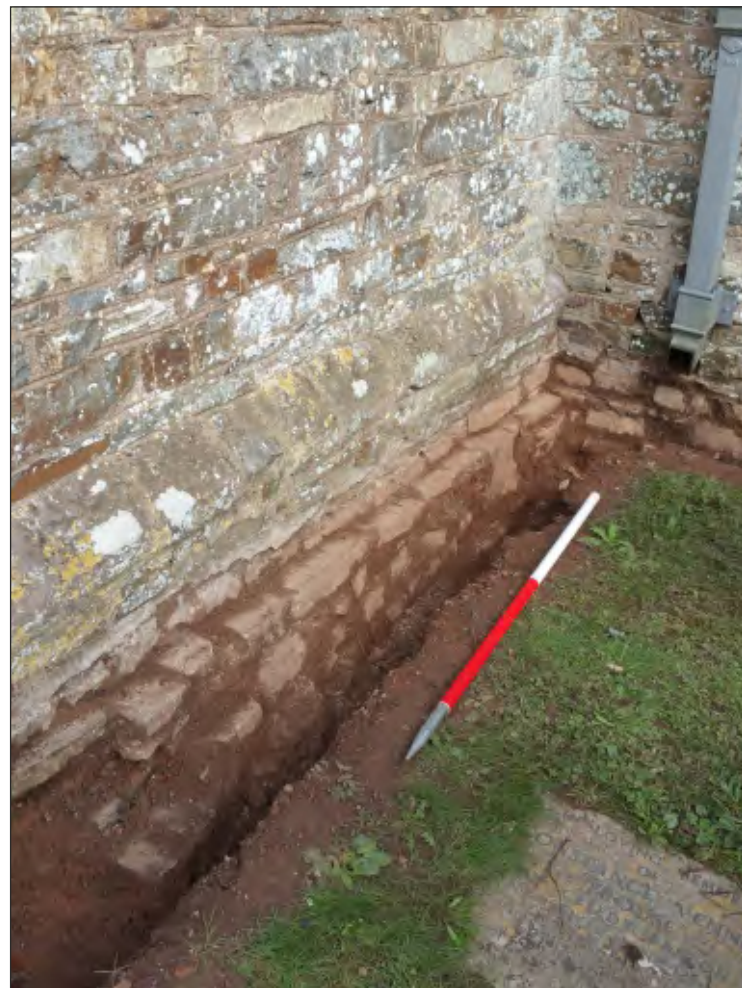
Pl. 4 General view of shallow foundations of later porch. 1m scale. Looking northwest.