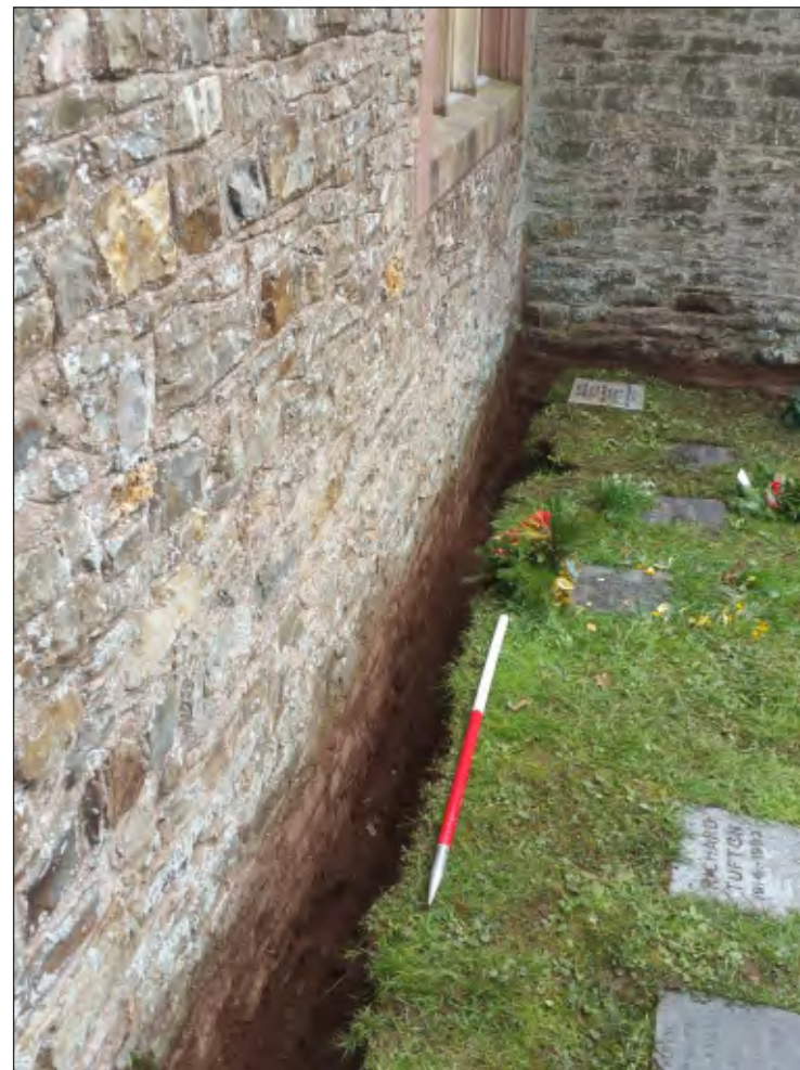
Pl. 2 General view of south aisle wall with foundation of south porch in background. 1m scale. Looking east.