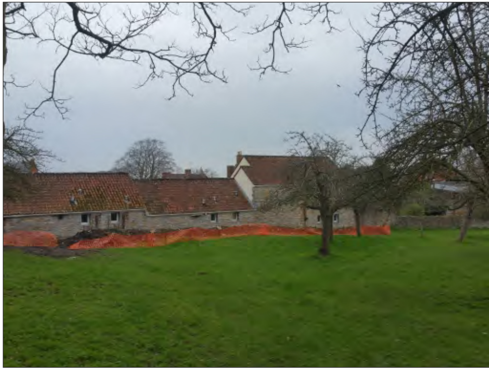
Pl. 1 General view of trench at rear of Chaingate Court from Abbey precinct. Looking west.