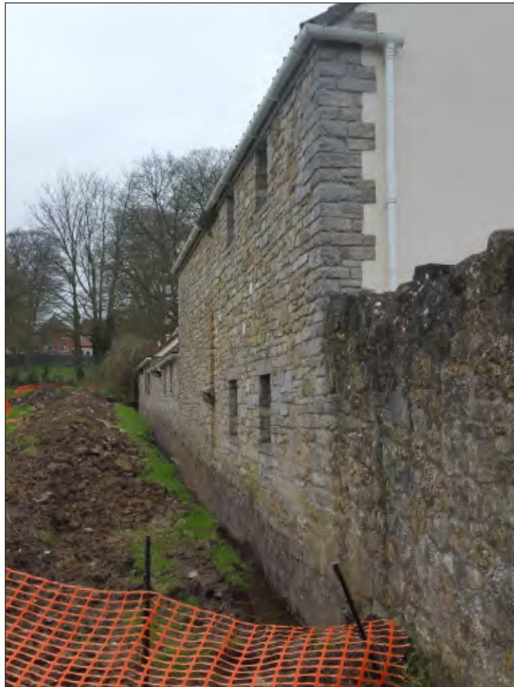
Pl. 2 General view of trench at rear of Chaingate Court. Looking southwest.