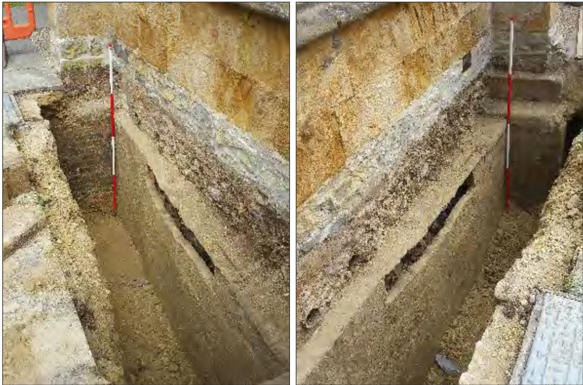
Fig. 2 Plan and photos showing remains of boiler house built against foundations of south aisle.