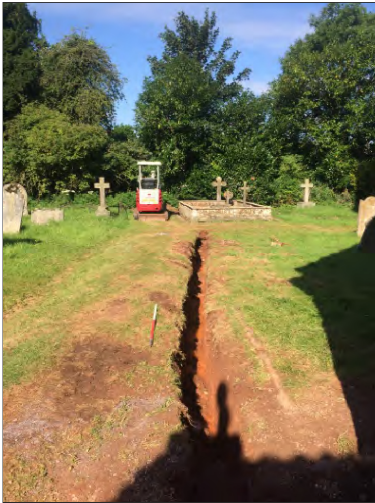
Pl. 1 General view of trenching. 1m scale. Looking west.