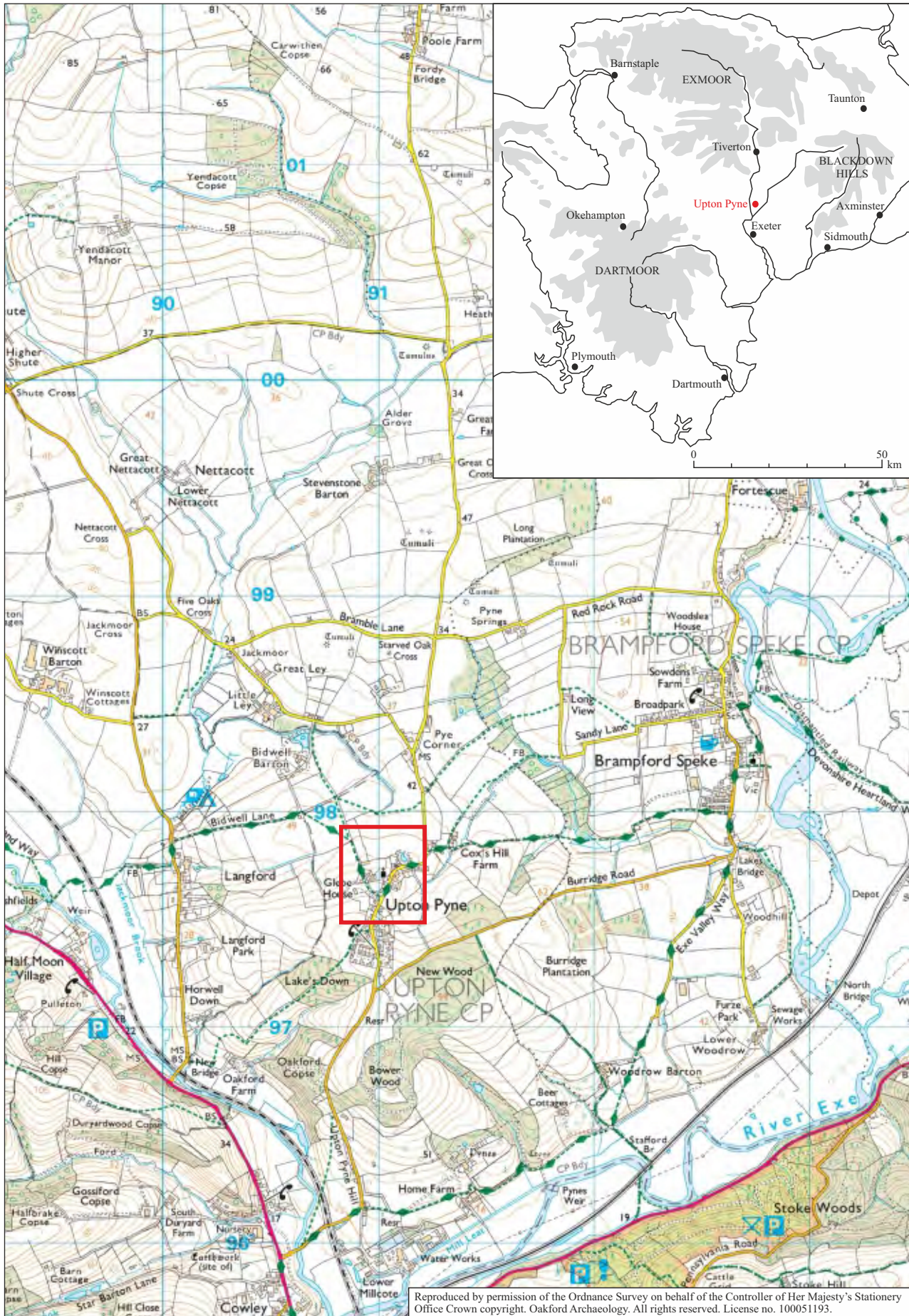
Fig. 1 Location of site.