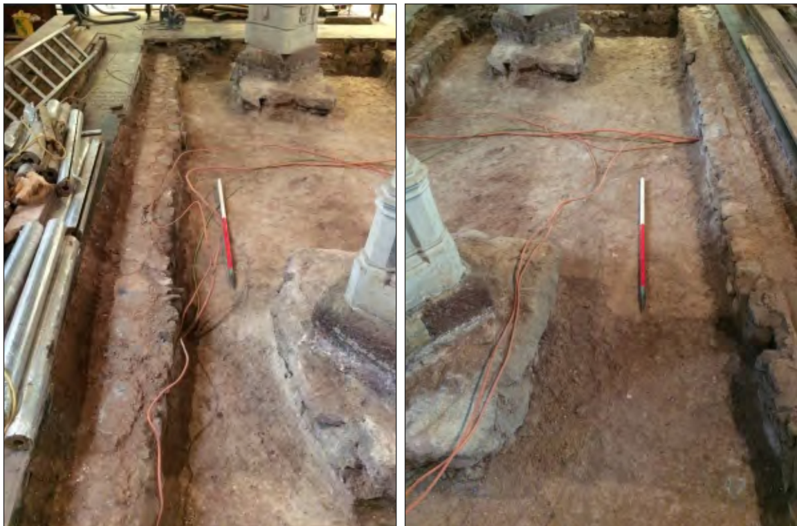
Fig. 2 Plan showing location of observations and photos showing 19th century lime screed with low walls walling supporting timber flooring and pews.