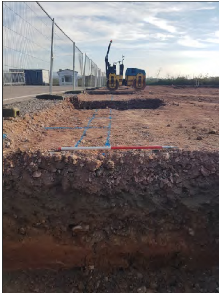
Pl. 2 Section showing deposit sequence. 1m scale. Looking southeast.