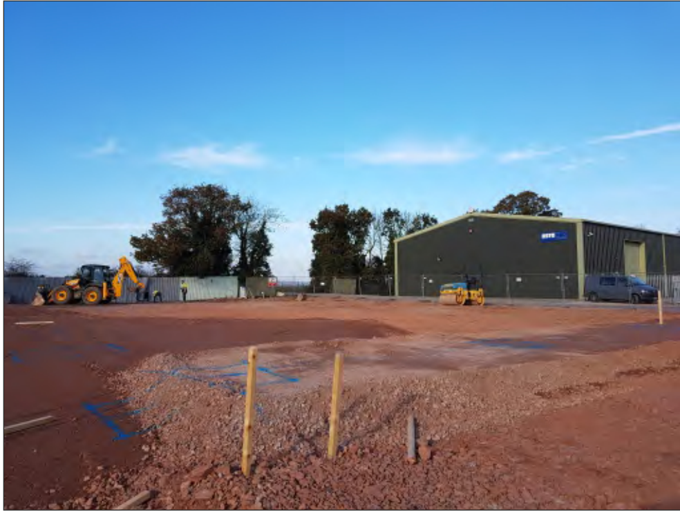
Pl. 1 General view of site. Looking north.