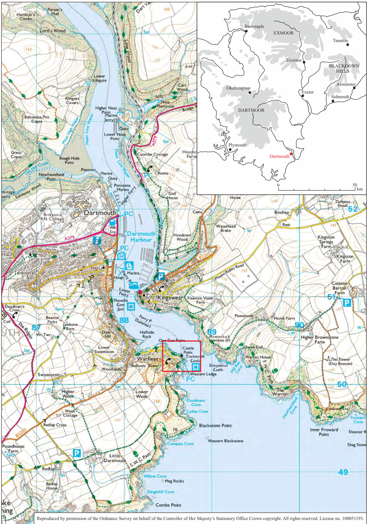
Fig. 1 Location of site.