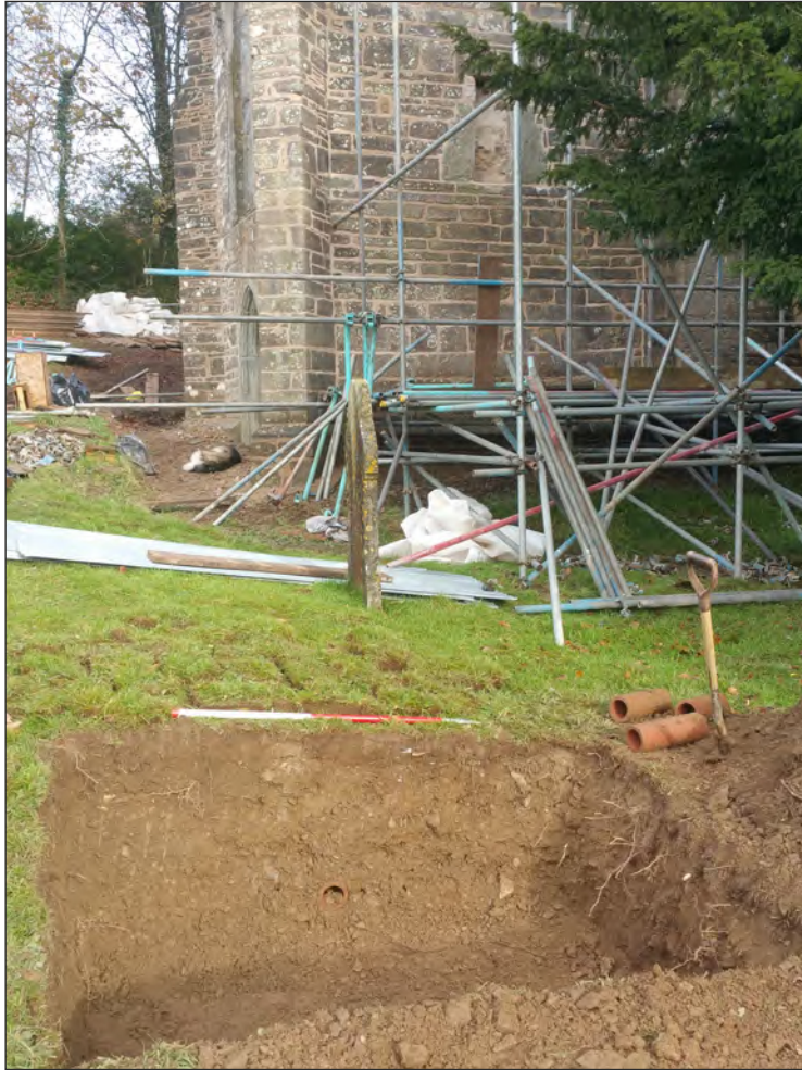
Pl. 1 Section through soakaway showing deposit sequence. 1m scale. Looking north.