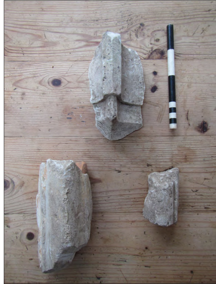
Pl. 2 Close-up showing window mullion fragments (below) and tracery fragment (above). 0.2m scale.