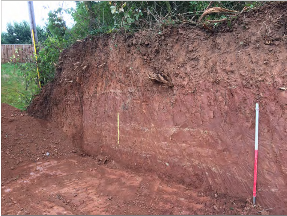
Pl. 1 Section through earth bank along southeast edge of site. 1m scale. Looking east.