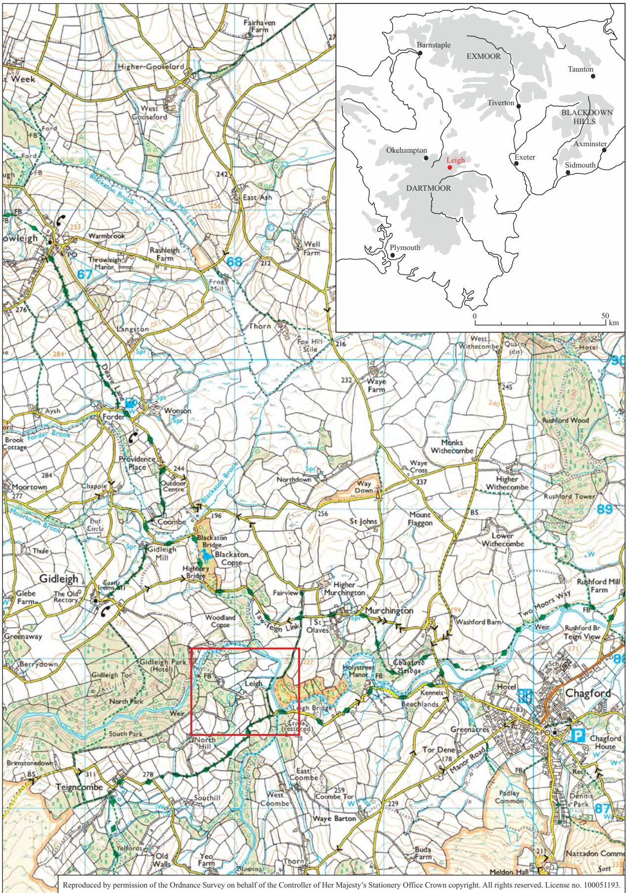
Fig. 1 Location of site.