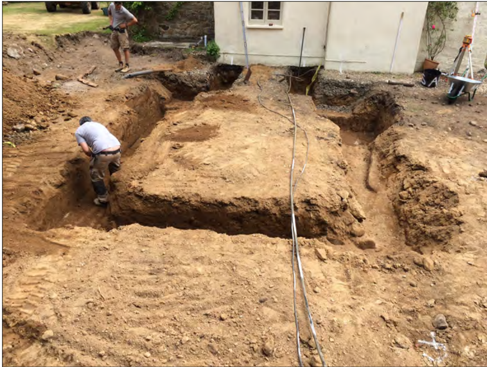
Pl. 1 General view of reduced area and foundation trench. Looking northeast.