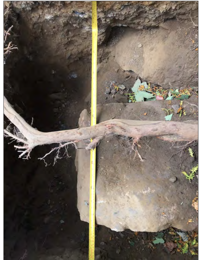
Pl. 2 Close-up of stone slabs sealing vaults exposed in footpath. Looking north.