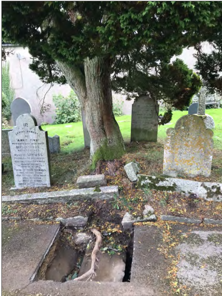
Pl. 1 General view of excavations in footpath showing brick and stone vaults. Looking east