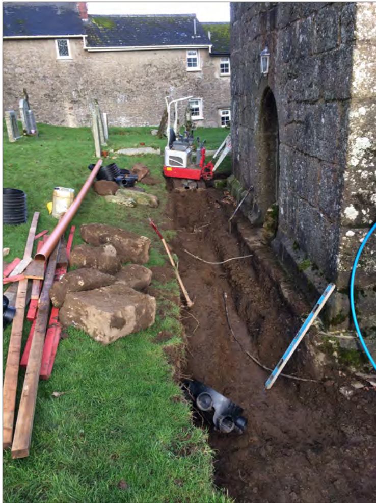
Pl. 3 General view of excavations to west of tower. Looking north.