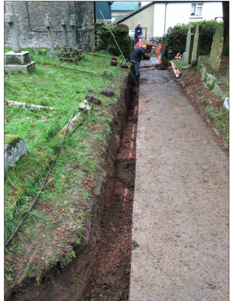
Pl. 4 General view of excavations to north of church. Looking north.