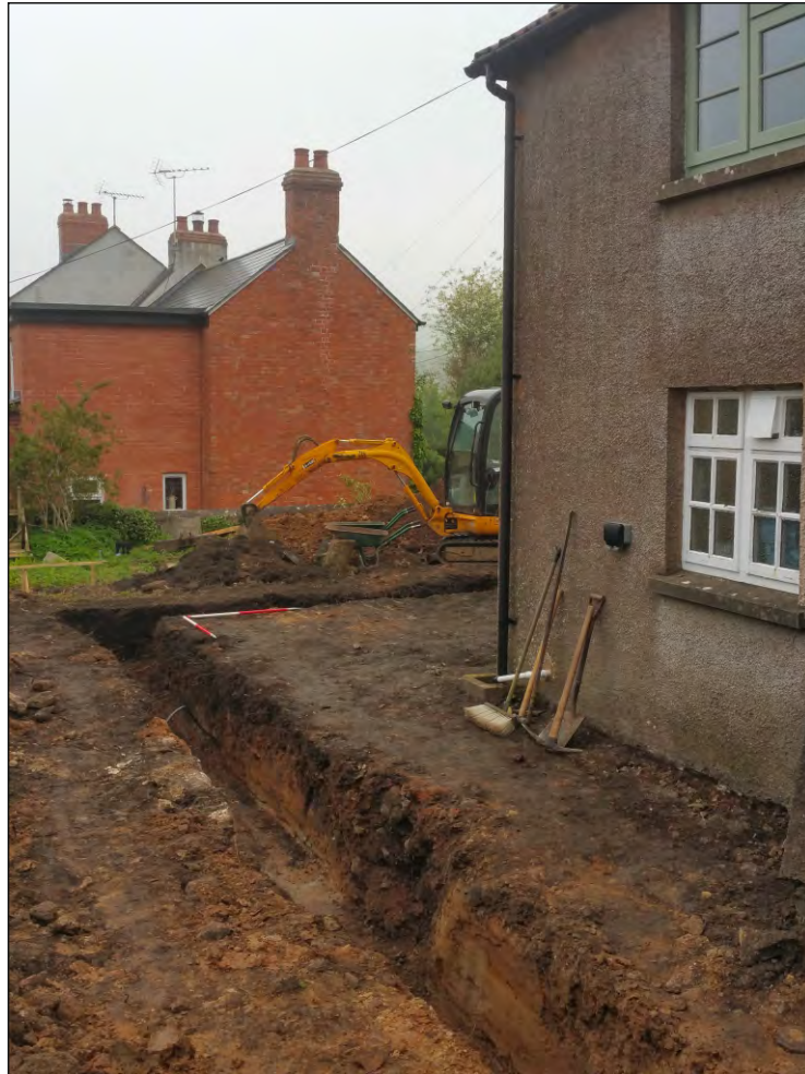
Pl. 1 General view of excavations. 1m scales. Looking north.