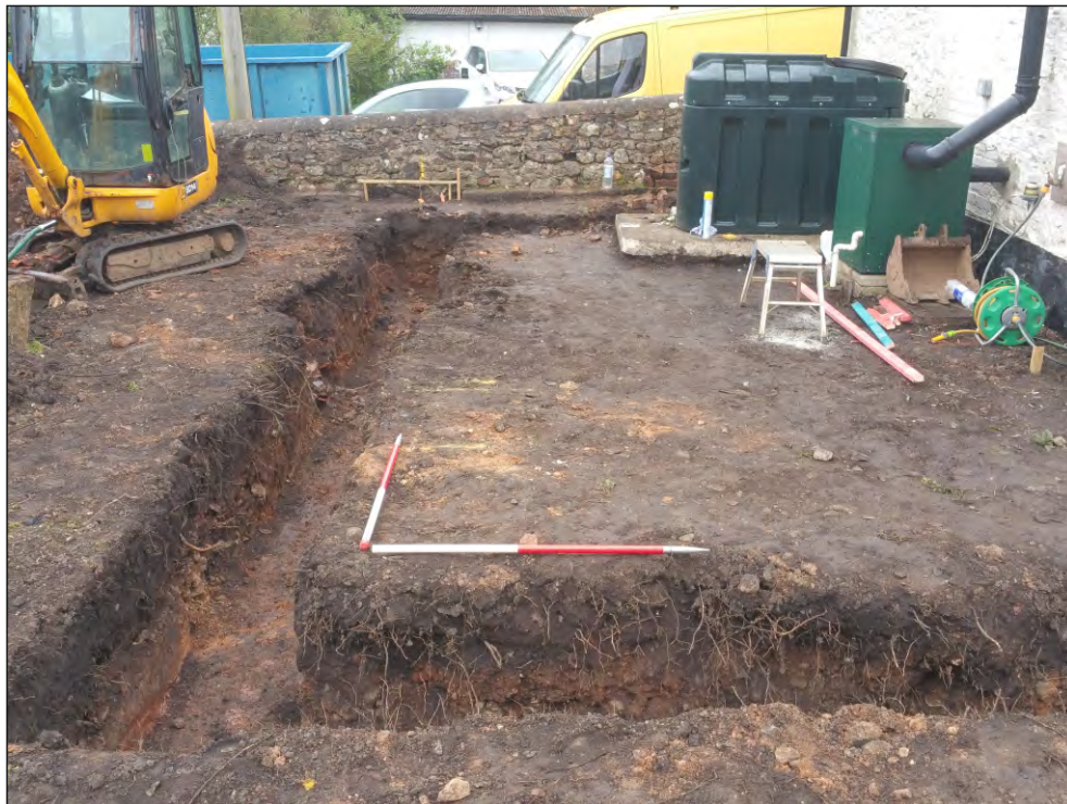
Pl. 2 General view of excavations showing extensive garden soil (100). 1m scales. Looking east.