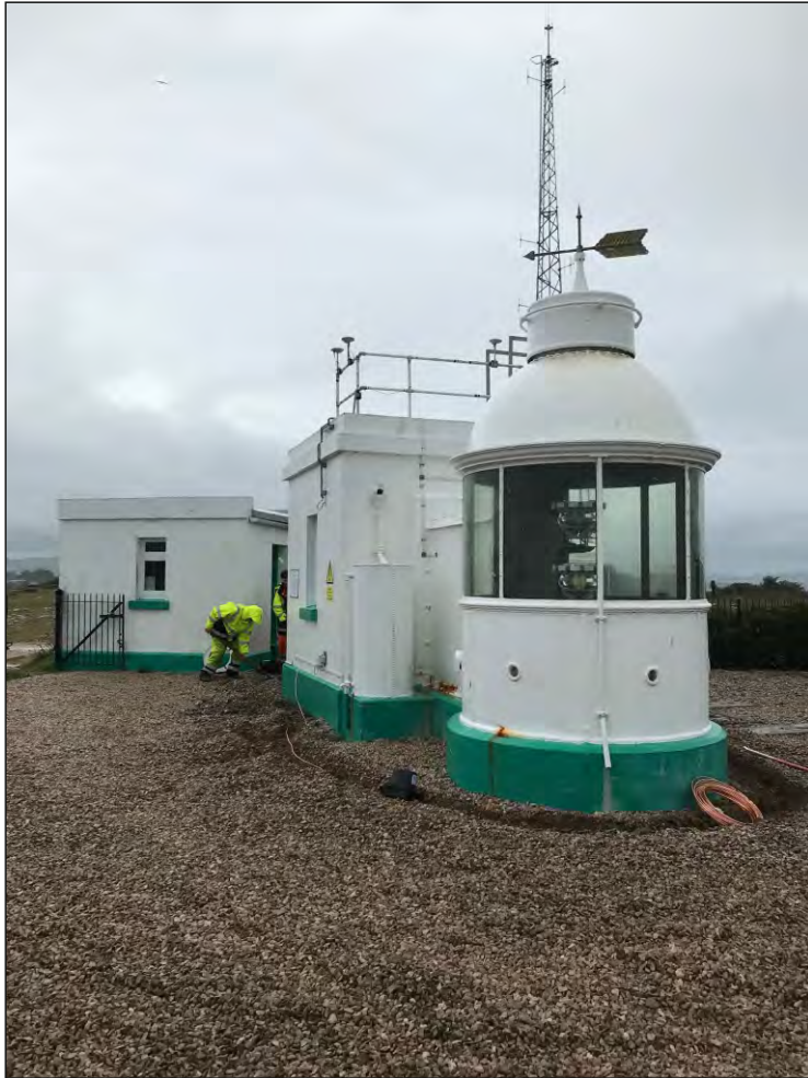
Pl. 1 General view of Berry Head Lighthouse showing extent of trenching. Looking southwest.