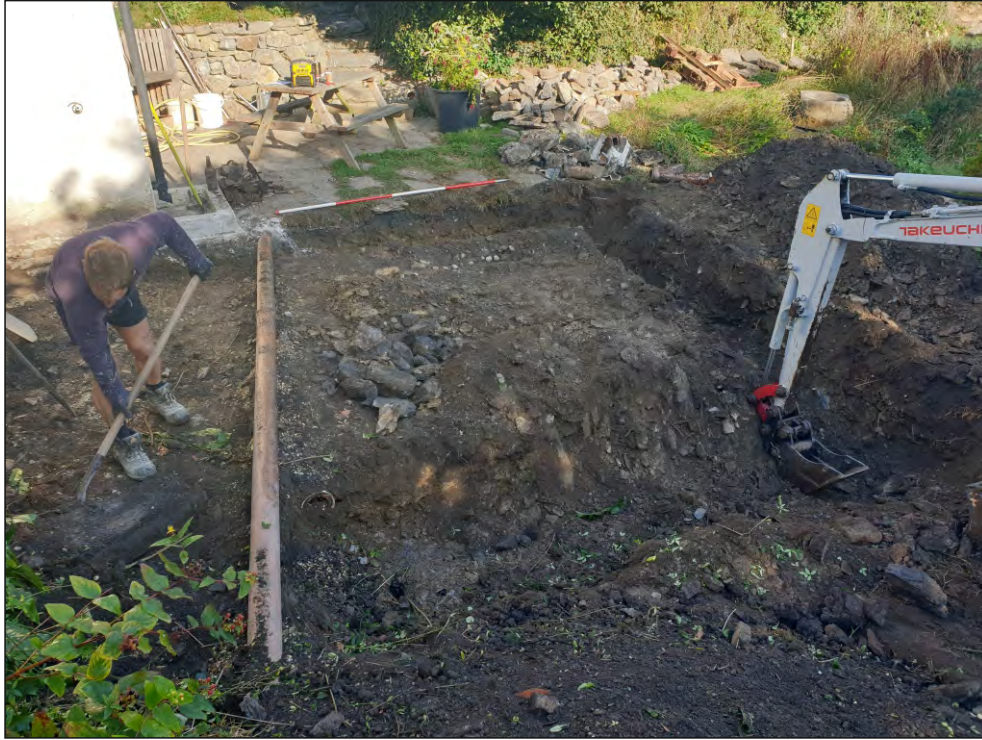
Pl. 1 General view of excavations. 2m scale. Looking north.