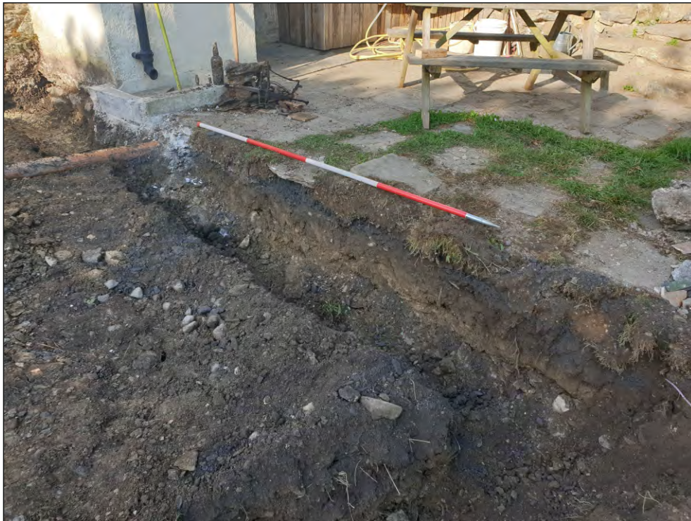
Pl. 2 Section showing deposit sequence . 2m scale. Looking northwest.