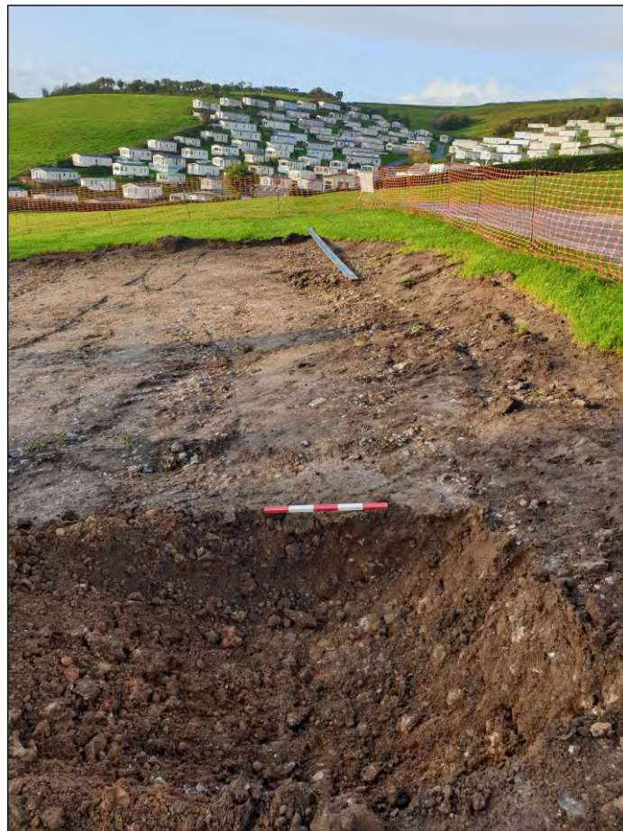
Pl. 2 General view of excavations showing depth of tree pit. 0.5m scale. Looking southwest.