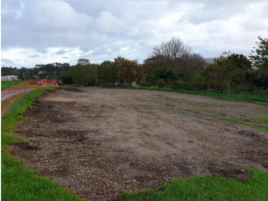
Pl. 1 General view of excavations. Looking northeast.