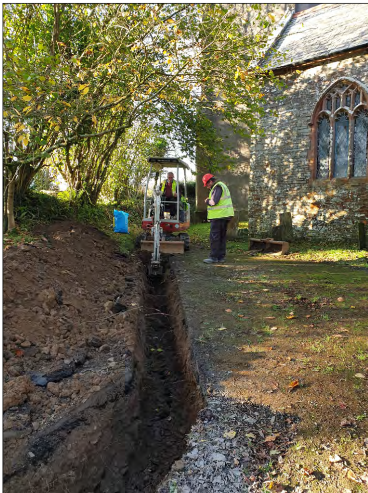
Pl. 3 General view of trench. Looking northwest.