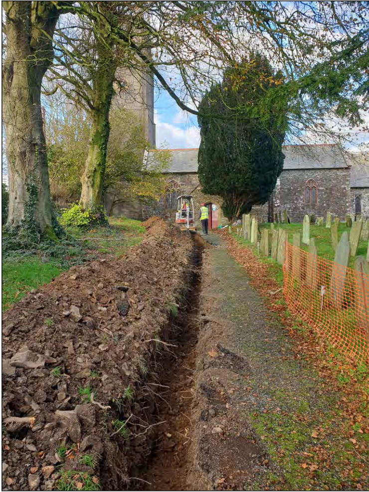
Pl. 1 General view of trench. 2 m scale. Looking north.