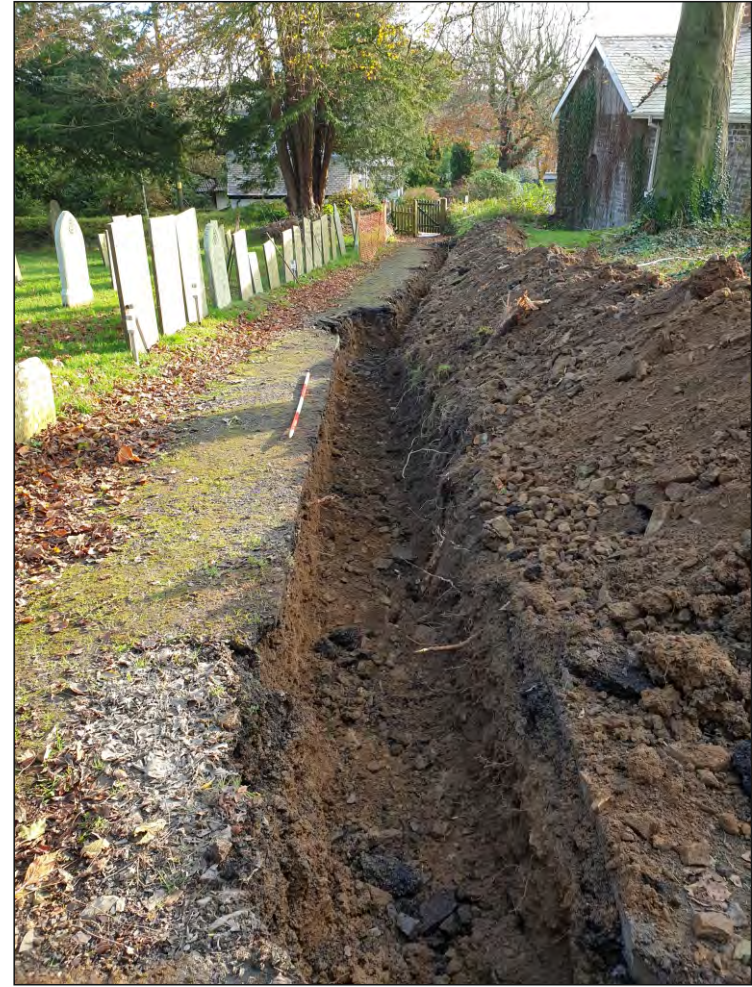
Pl. 2 General view of trench. 2m scale. Looking south.