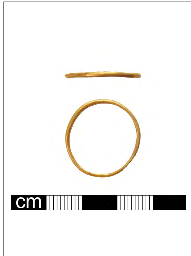
Pl. 4 Gold ring (DEV-488D61).