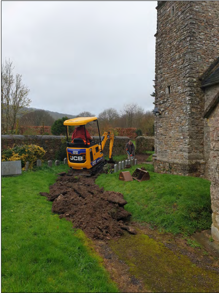
Pl. 1 General view of excavations. Looking northwest.