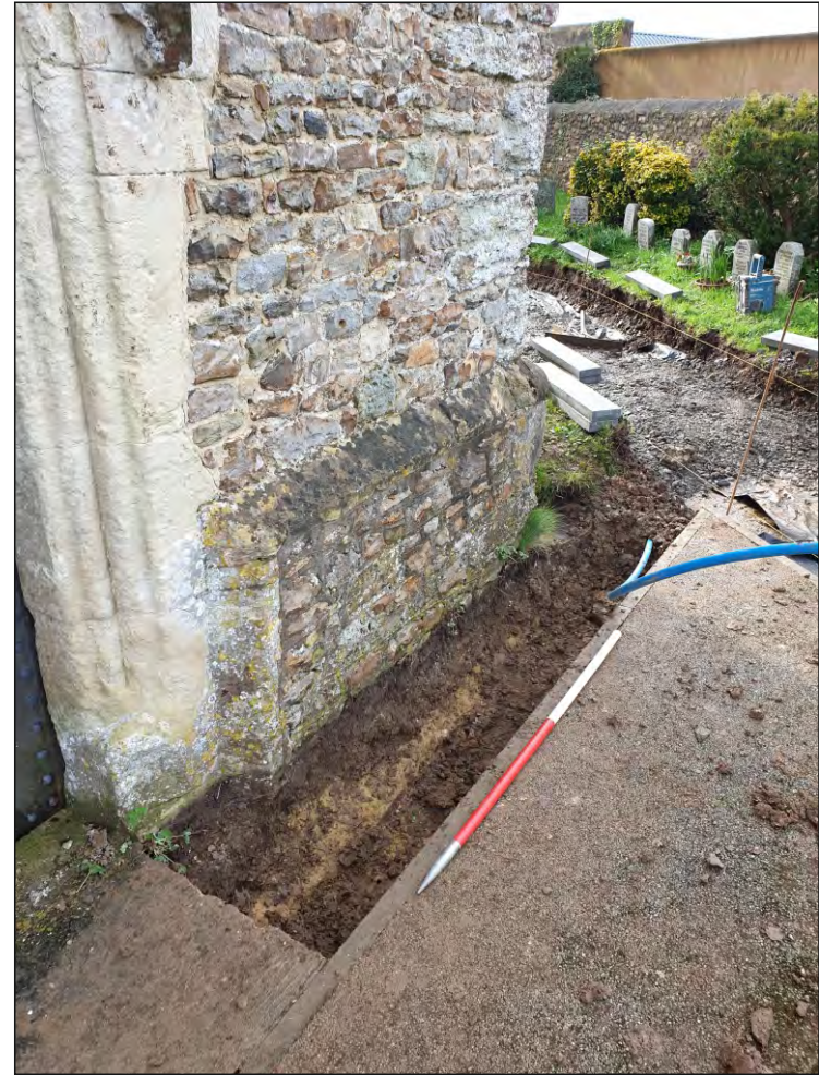
Pl. 2 General view of projecting foundations of tower. Looking southeast.