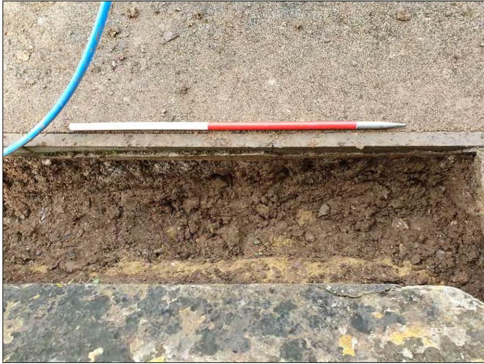
Pl. 3 General view of trench showing depth of charnel soil (101). 0.5m scale. Looking west.